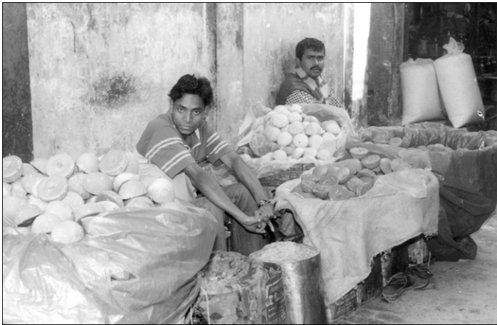
Vendors display date molasses or khejurer gur at Thana Road Bazaar in Faridpur town. Molasses sells between Tk 30 and Tk 32 a kg.