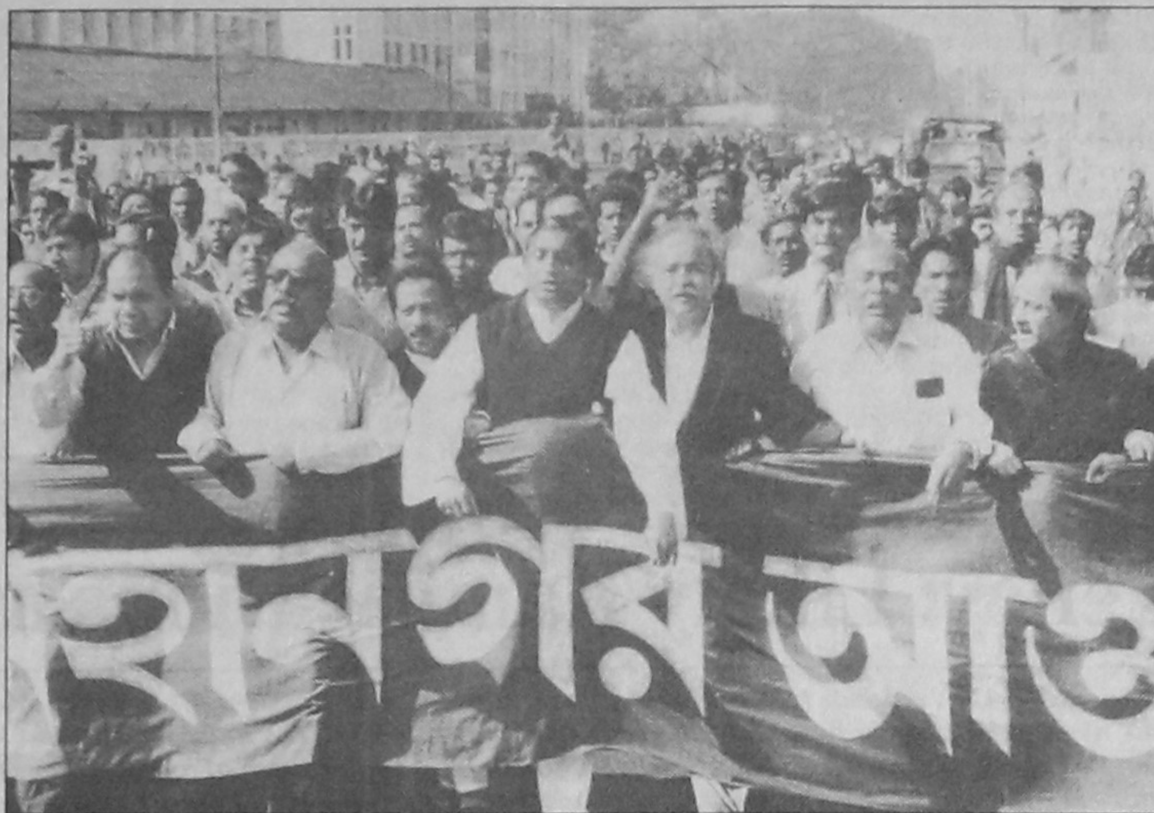
Bangladesh Awami League brought out a procession in the city yesterday denouncing the bomb attack on the CPB rally on Saturday.