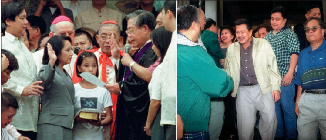
Gloria Macapagal Arroyo (C, grey suit) takes oath as the new Philippine president from Supreme Court Chief Justice Hilario Davide at the EDSA Shrine (left) while deposed president Joseph Estrada leaves the Malacanang Palace in Manila yesterday.