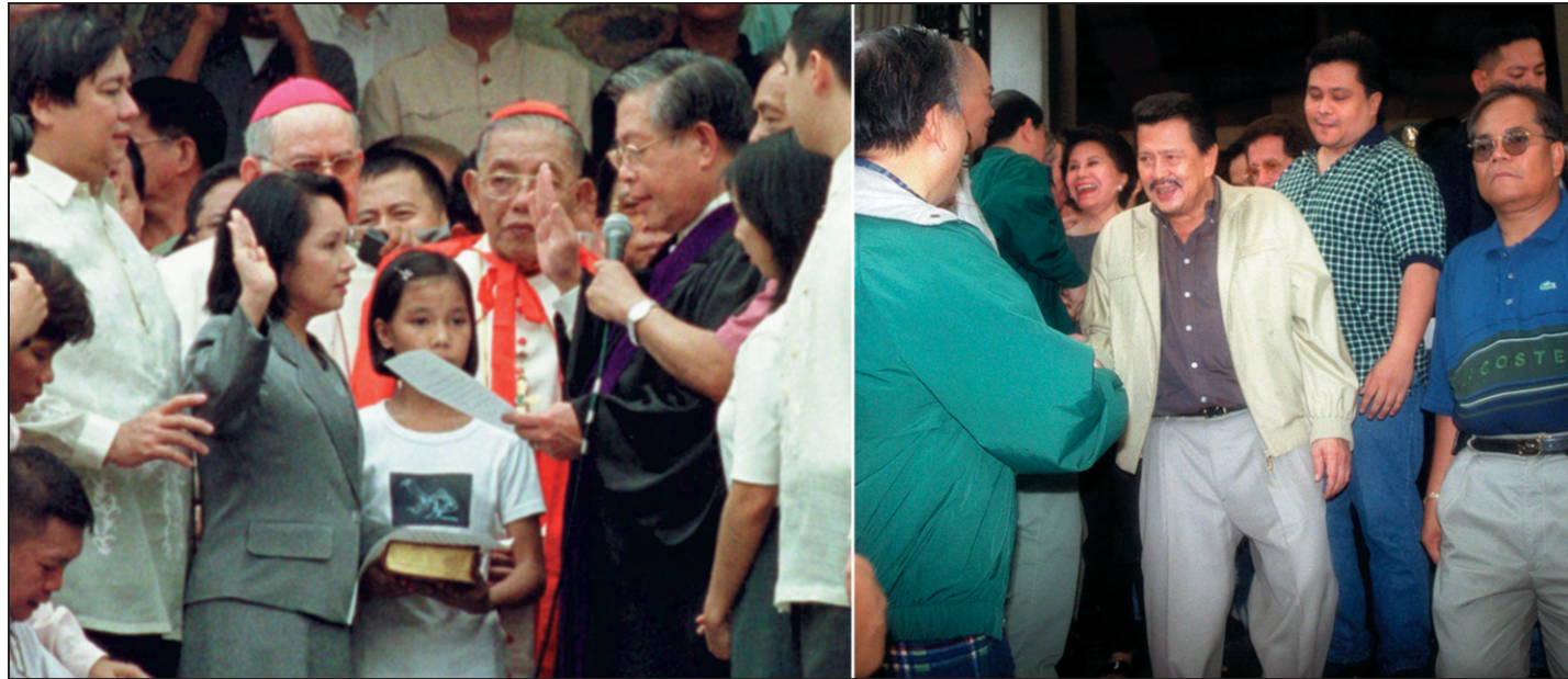
Gloria Macapagal Arroyo (C, grey suit) takes oath as the new Philippine president from Supreme Court Chief Justice Hilario Davide at the EDSA Shrine (left) while deposed president Joseph Estrada leaves the Malacanang Palace in Manila yesterday.