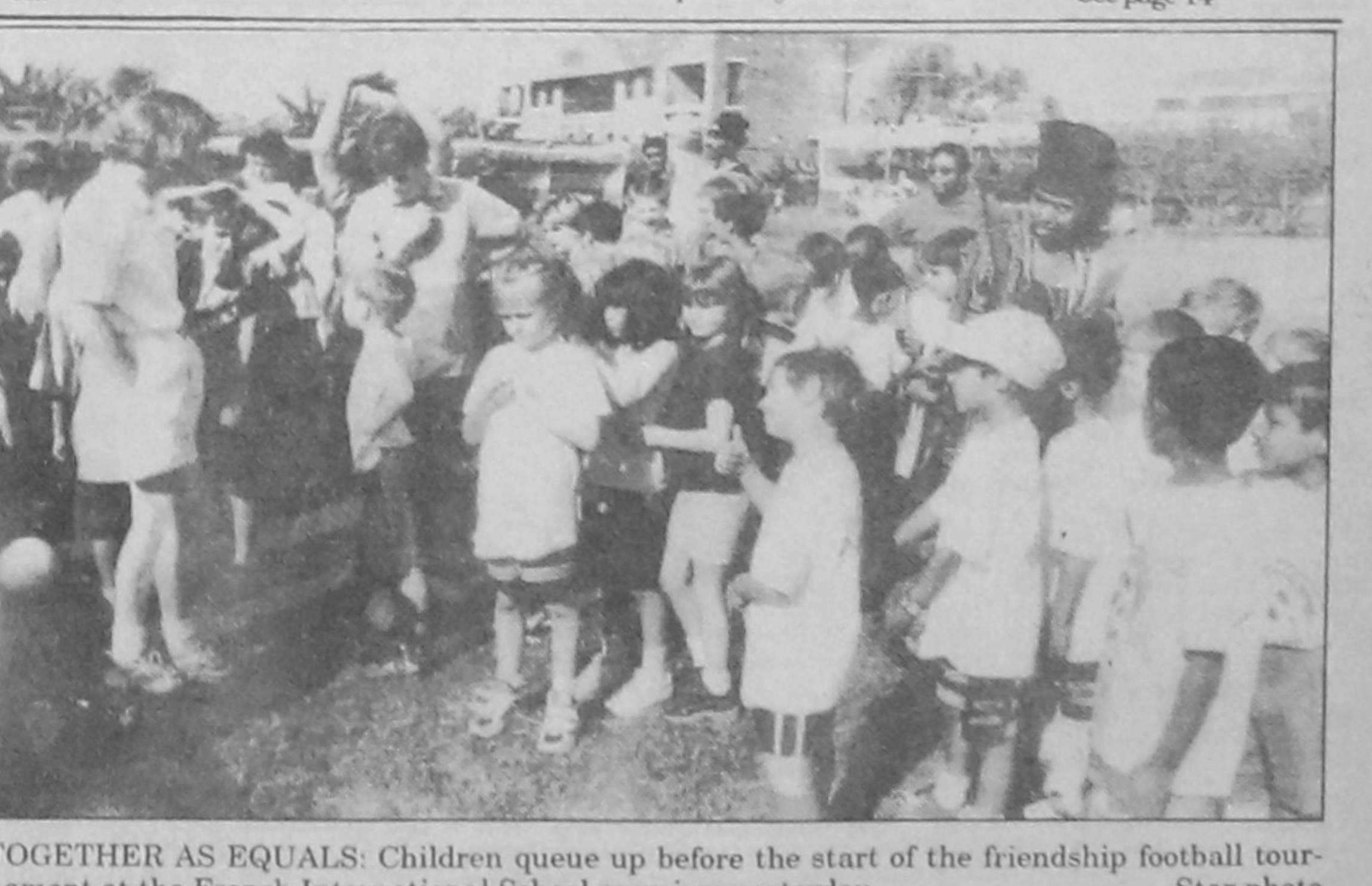
TOGETHER AS EQUALS: Children queue up before the start of the friendship football tournament at the French International School premises yesterday.

eased past Michal Tabera and Silvia Farina Elia. Safin said his injured elbow was feeling much better. "I am playing 100 per cent. I am giving everything, especially with the serve. For the moment (the elbow) is working," he said. But French 13th seed Cedric Pioline and compatriot Sandrine Testud, the 14th seed, wilted in the Melbourne heat and crashed out. "I don't like the surface here too much. I don't like the balls and it's too hot," moaned Pioline who was beaten by Martin. Crowd favourite Anna Kournikova also threw a tantrum but made it to the last 16 despite dropping a set against doubles partner Barbara Schett. "Ice, get me some ice," she shouted at a ballboy during one of the handovers. She later claimed she had just been "asking for ice in a cup after