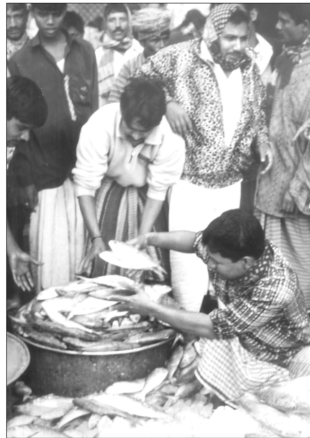
Winter is not the season of hilsa. Even then there has been a glut of the delicious fish in the markets of Chandpur situated on the confluence of the rivers Padma and Meghna, surprising the fish traders. Hilsa price has unexpectedly declined across the district. However, the size of the fish is small and the weight varies from 500 to 1,200 grams.

The projects include road carpeting and construction of box culverts, gates and road dividers.