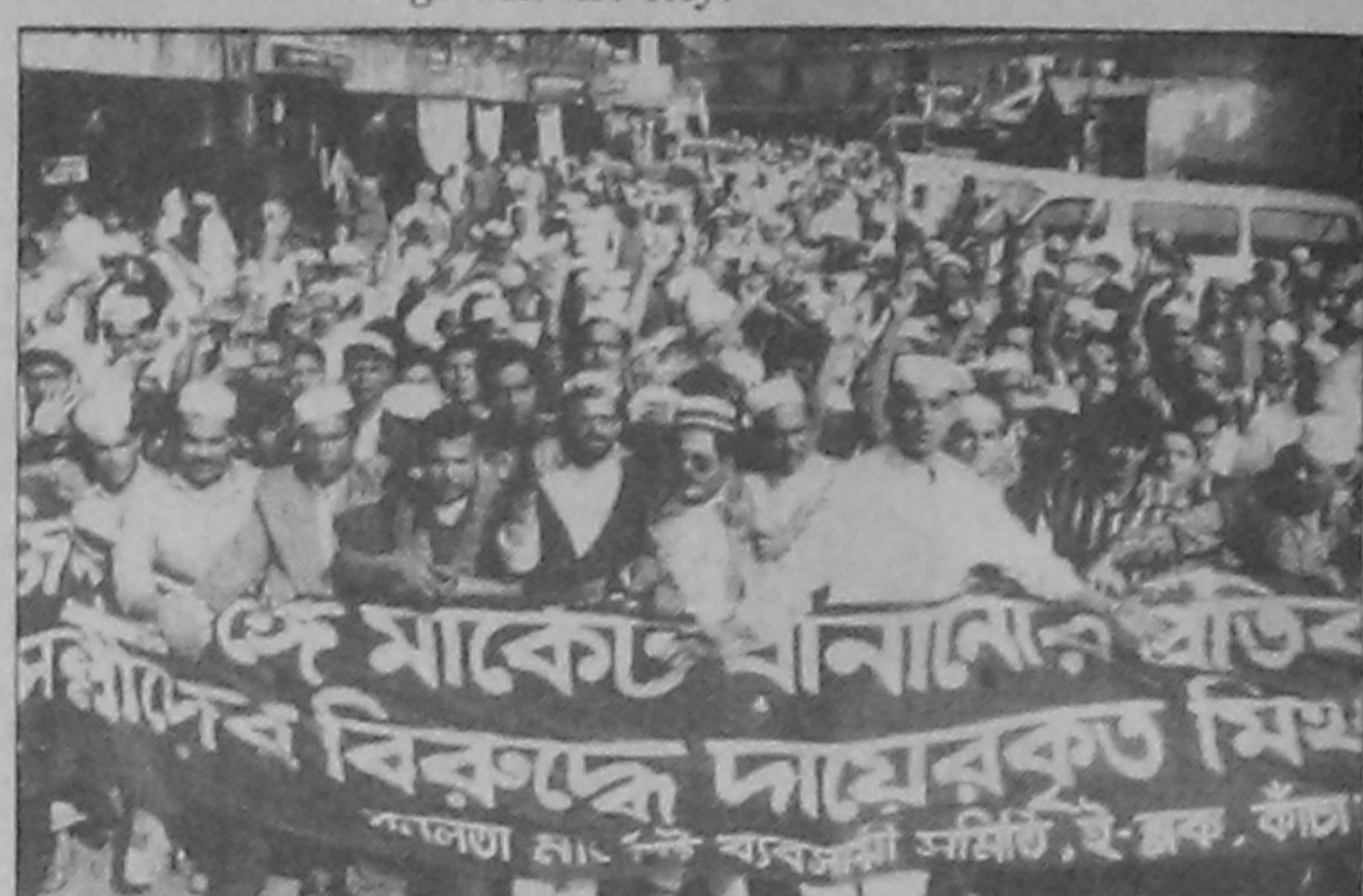
Traders of the Bonolota Market in New Market brought out a procession inside the market yesterday after Juma prayers. They were protesting the construction of shops on the premises adjacent to the New Market Kutcha Bazar Mosque.