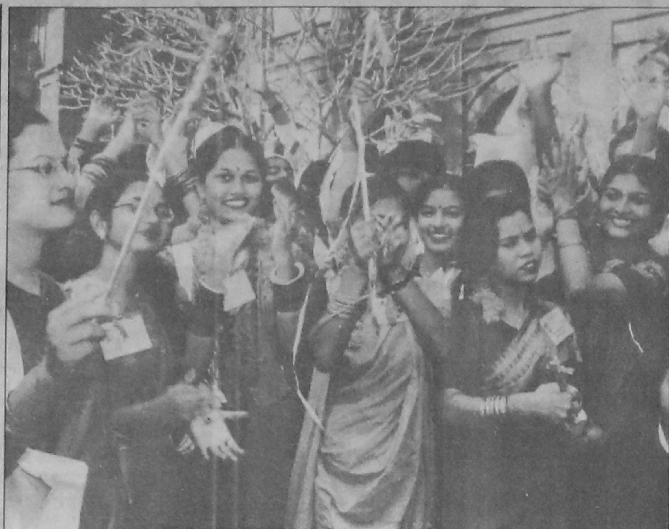
Students of Soil Science Department of the Dhaka University brought out a colourful rally on the campus yesterday to mark the golden jubilee of the department.

National Committee of Fair Election Monitoring Alliance (FEMA) at its meeting held on Thursday took note of the reported statement of the Chief Election Commissioner in which he underlined the need for registration of political parties as a necessary step to promote free and fair election in the country, says a press release. The committee was of the opinion that such a measure would go a long way in making political parties accountable not only to the public but to their own rank and file and make their activities in such important matters as elections to different office bearers, nominations of candidates to national elections and receiving and disbursing funds from various sources transparent.