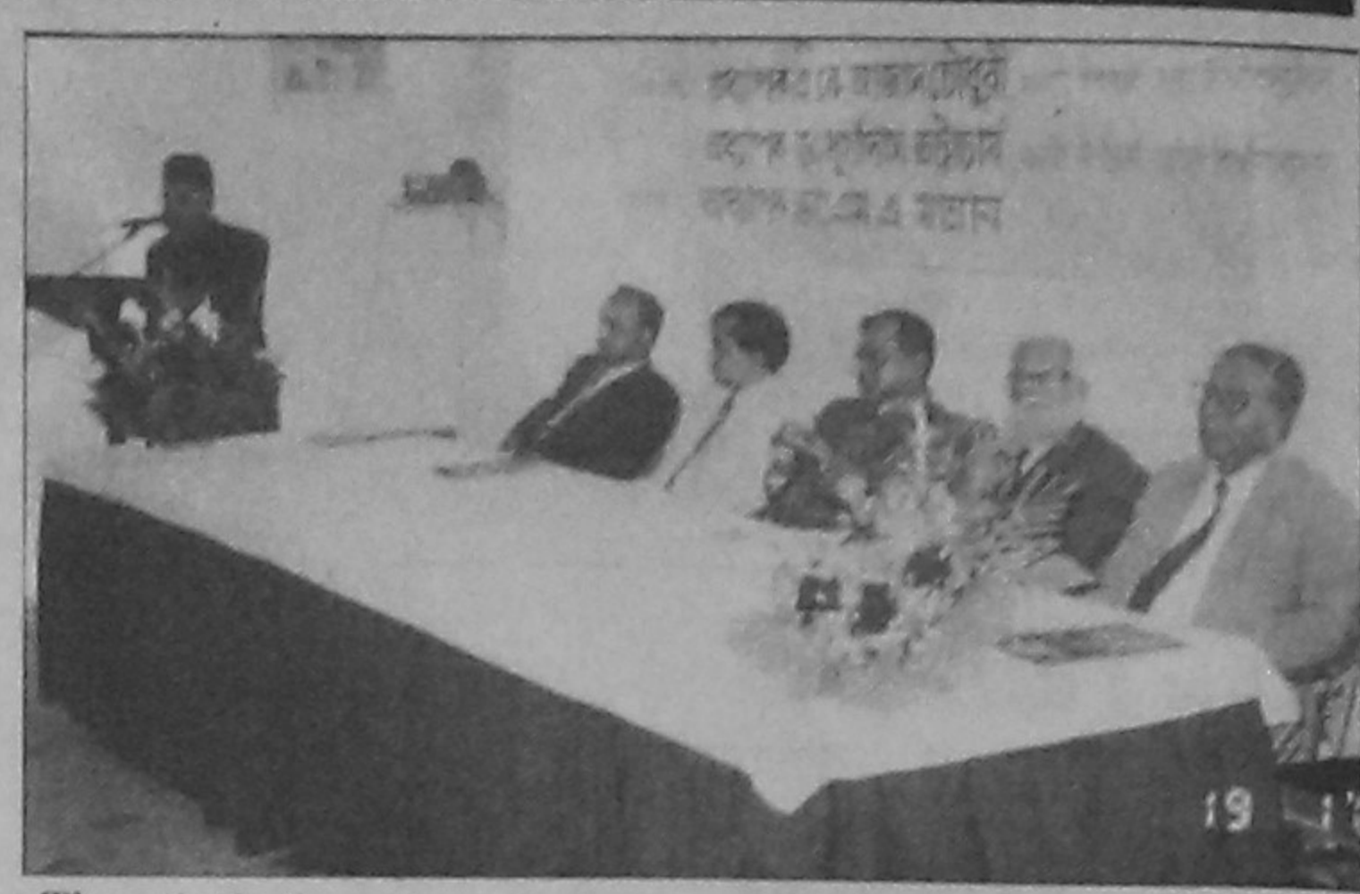
The ninth founding anniversary of the Neurology Foundation was observed yesterday. Picture shows speakers at a function held at the Neurology Foundation & Hospital auditorium at Kalabagan in the city.