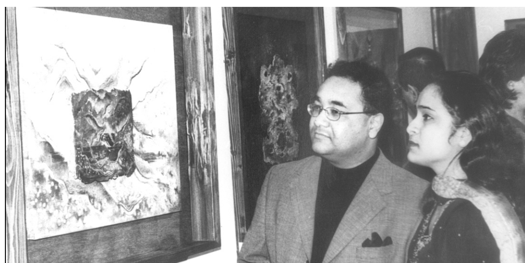
Visitors admire a piece by Alka Mathur at the joint show by two Indian artists, Naresh Kapuria and Alka Mathur, now being held at Bengal Gallery of Fine Arts. Minister for Communications Anwar Hossain performed the inauguration of the 16-day show yesterday. High Commissioner of India to Bangladesh M.L. Tripathi was present the inaugural ceremony as special guest.