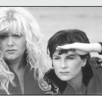
French and Saunders on Star World at 3:00 in the morning.

Abar Fire 12:40 I Dream of Jeannie 1:15 Samoyer Game 2:00 Drama: Hirono Dhaho 2:50 I Focus 3:00 Bangla Cinema: Digonta Godhuli 6:00 Reciting from Holy Quran 6:10 I Music 6:40 Addar Table 7:15 Abriti ar 7:30 Arif 7:30 Ekattorer Dinguli 8:00 Asia 8:00 Sarejomin 8:40 Your Choice Ole 9:15 Alapone 10:00 Drama: Kajol Rekha 10:50 I Focus 11:00 Bangla Tele Film: Padma Nadir Majhi