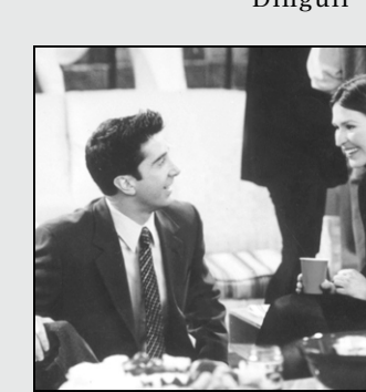
Friends on Star World at 8:30 tonight.

3:05 Bangla Movie: 6:00 Ekushey News Headlines 6:05 The Big Fight 6:30 Gillette World Sports 1 Special 7:00 0: Pepso dent 1 Braincheck 7:30 0 Ekushey News H 8:00 Drama Serial: Probashi Porijon 8:30 h Virgin Takdum 9:00 Ti Shukrobarer s 11:00 Ekushey Late Night News 11:15 E d Shoptah 11:30 Ekushey News Headlines