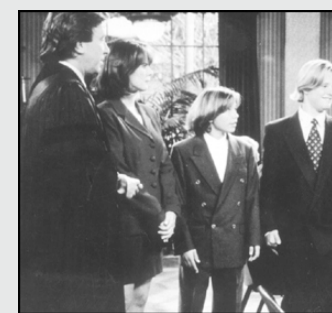
Home Improvement on star World at 10:30 a.m.

Days 11:30 Walker Texas Ranger 12:30 Martial Law 1:30 The Oprah Winfrey Show 2:30 World's Wildest Police Video 3:30 Grace Under Fire 4:00 The Bold and the Beautiful 4:30 Mrk & Mindy 5:00 Happy Days 5:30 Baywatch 6:30 Hollywood Squares 7:00 Home Improvement 7:30 Star Ar 7:30 Ekattorer Dinguli 8:00 Asia 8:00 Sarejomin 8:40 Your Choice Ole 9:15 Alapone 10:00 Drama: Kajol Rekha 10:50 I Focus 11:00 Bangla Tele Film: Padma Nadir Majhi