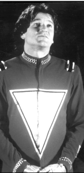
Mork and Mindy on Star World at 4:30 afternoon.

Hardtalk 4:00 BBC News 4:30 Talking Movies 5:00 BBC News 5:30 Panorama Cutting 6:00 BBC News 6:30 IT: India Tomorrow 7:00 BBC News 7:15 World Business Report 7:30 Talking Movies 8:00 BBC News 8:30 Hardtalk 9:00 BBC News 9:30