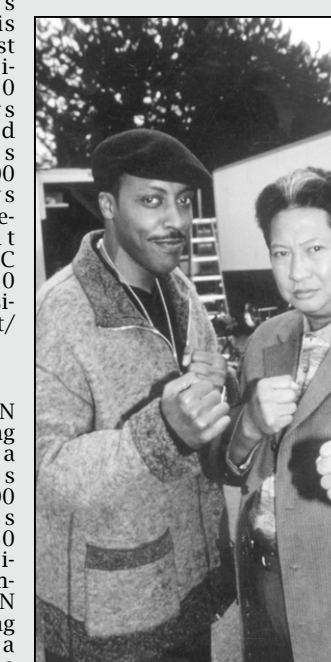
Martial Law on Star World at 12:30 in the noon.

Asia 6:45 Asia Business Morning 7:00 CNN This Morning 10: 7:30 Moneyline 00 8:00 Larry King B Live 9:00 World C News 9:30 World C Sport 10:00 World News 10: 10:30 Showbiz 15 Today 11:00 Wo World News rld 11:30 Q&A (replay) 12:00 Bus World News ine 12:30 World s Report 1:00 World News 1:30 World Sport 2:00 World News 2:30 Insight 3:00 Larry King Live (replay) 4:00 World News 4:30 Biz Asia 5:00 me Asia Tonight 5:30 World Sport 6:00 World News 6:15 Asian Edition 6:30 Biz Asia 7:00 World P News 7:30 Wibizasia 8:00 Ge ar 8:30 World Sport 9:00 World News 9:30 Style South Asia 10:00 World News 10:30 Biz Asia 11:00 World News 11:30 Q&A