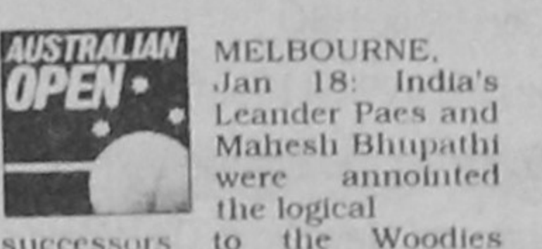
MELBOURNE, Jan 18: India's Leander Paes and Mahesh Bhupathi were appointed the logical successors to the Woodies...