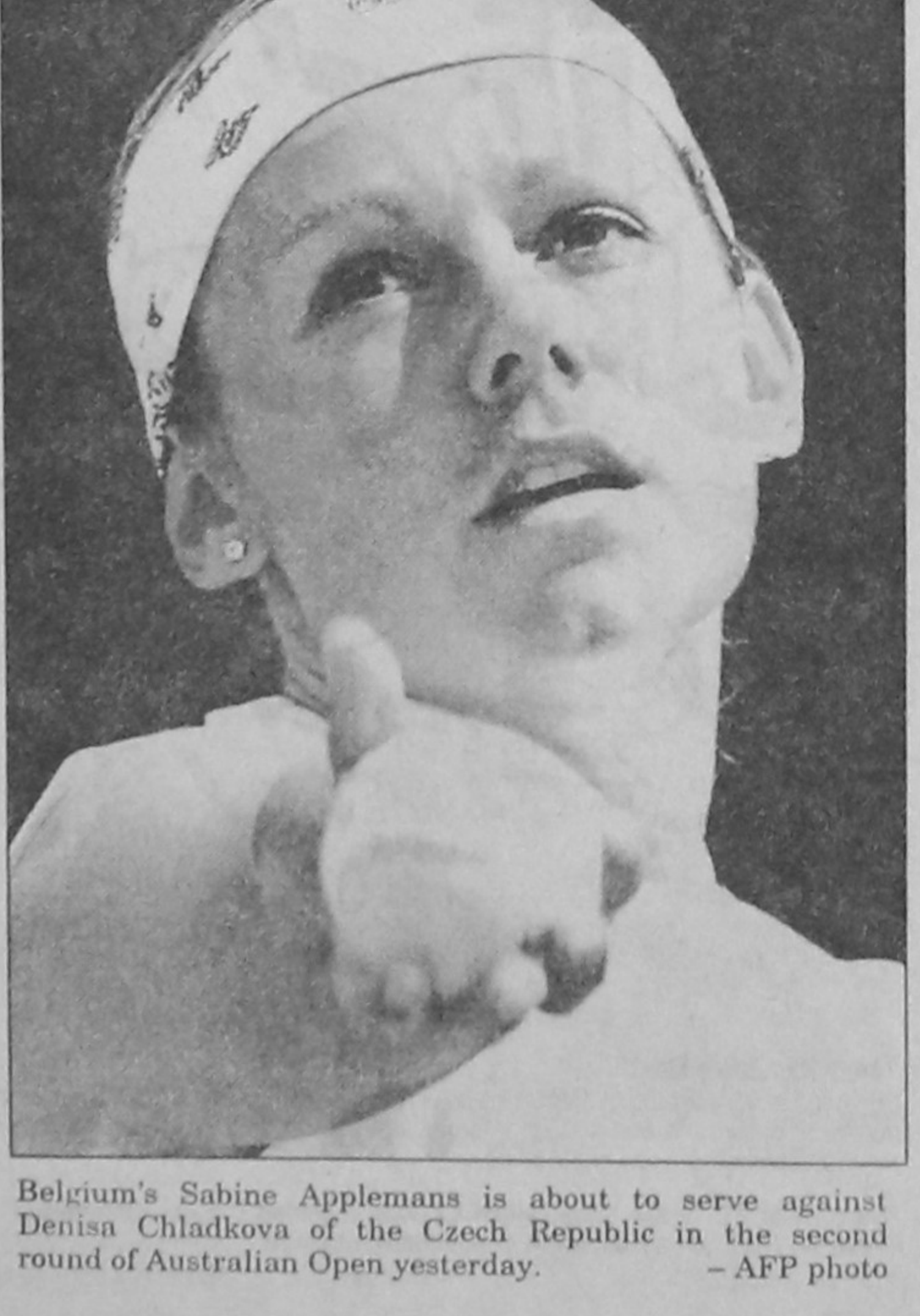
Result: Chittagong Karaphul won by nine wickets. Metro Blues v Barisal Maroons: Metro Blues: 261 all out in 45 overs (Chayan 88, Ayub 49, Sharfar 3/39)

From page 13 Khulna Tigers: 92 all out in 17.3 overs (Rabi 32, Rubel 6/39, Faruque 4/52)