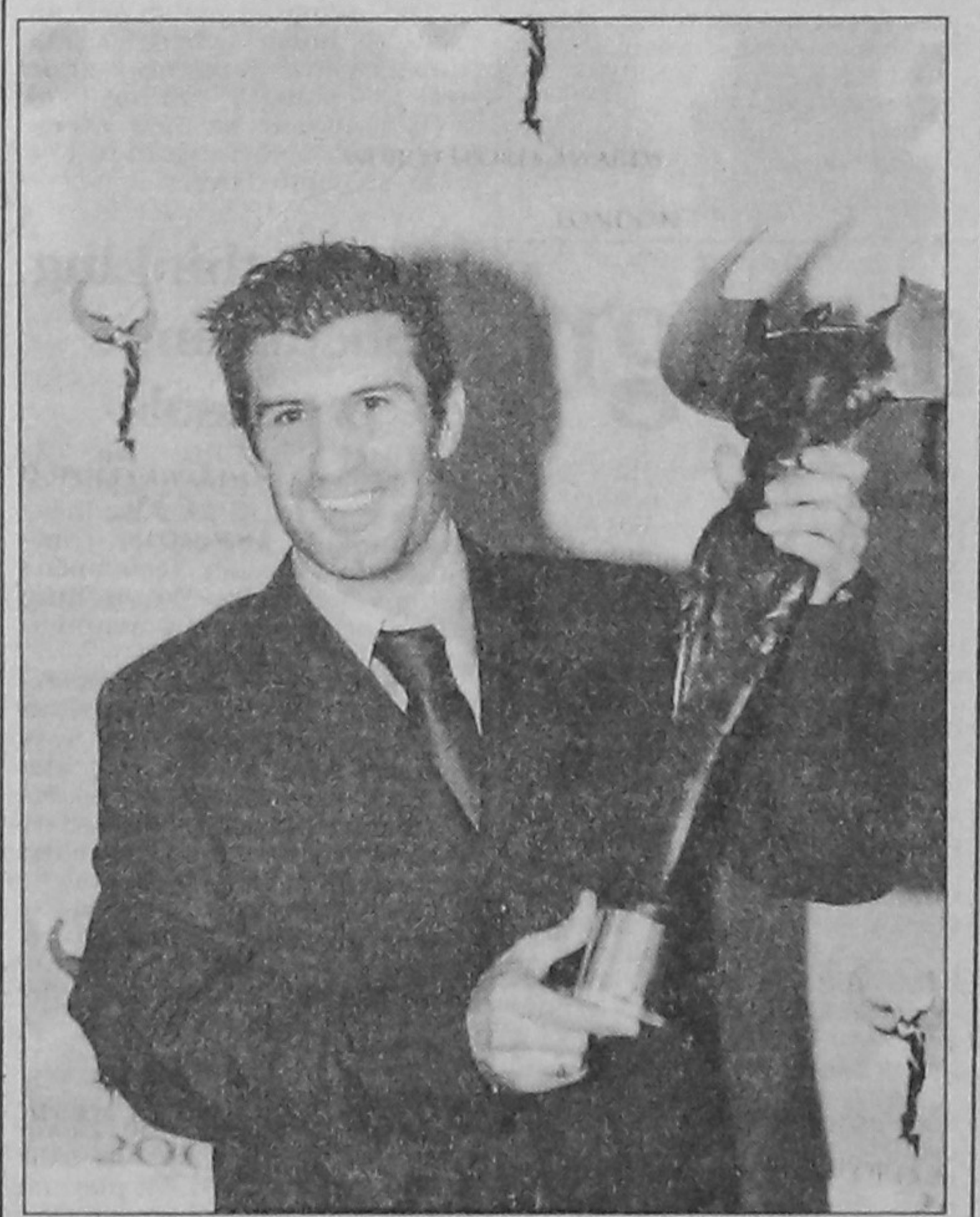
Portugal and Real Madrid superstar Luis Figo shows off the trophy for the Best Footballer during the World Sports Awards function at the Royal Albert Hall in London on January 16.