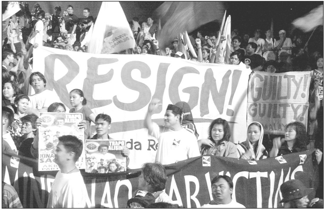
Some 10,000 anti-Estrada demonstrators call for Philippine President Joseph Estrada to resign on Wednesday to protest the Senate decision suppressing potentially damning evidence at President Joseph Estrada's corruption trial in Manila. Cardinal Sin warned the decision could spark bloodshed.

schoolchildren and activists, waved signs saying "Guilty", "Oust Estrada now" and "Justice died last night" as they chanted, "Enough is enough. You're exposed, Get out."