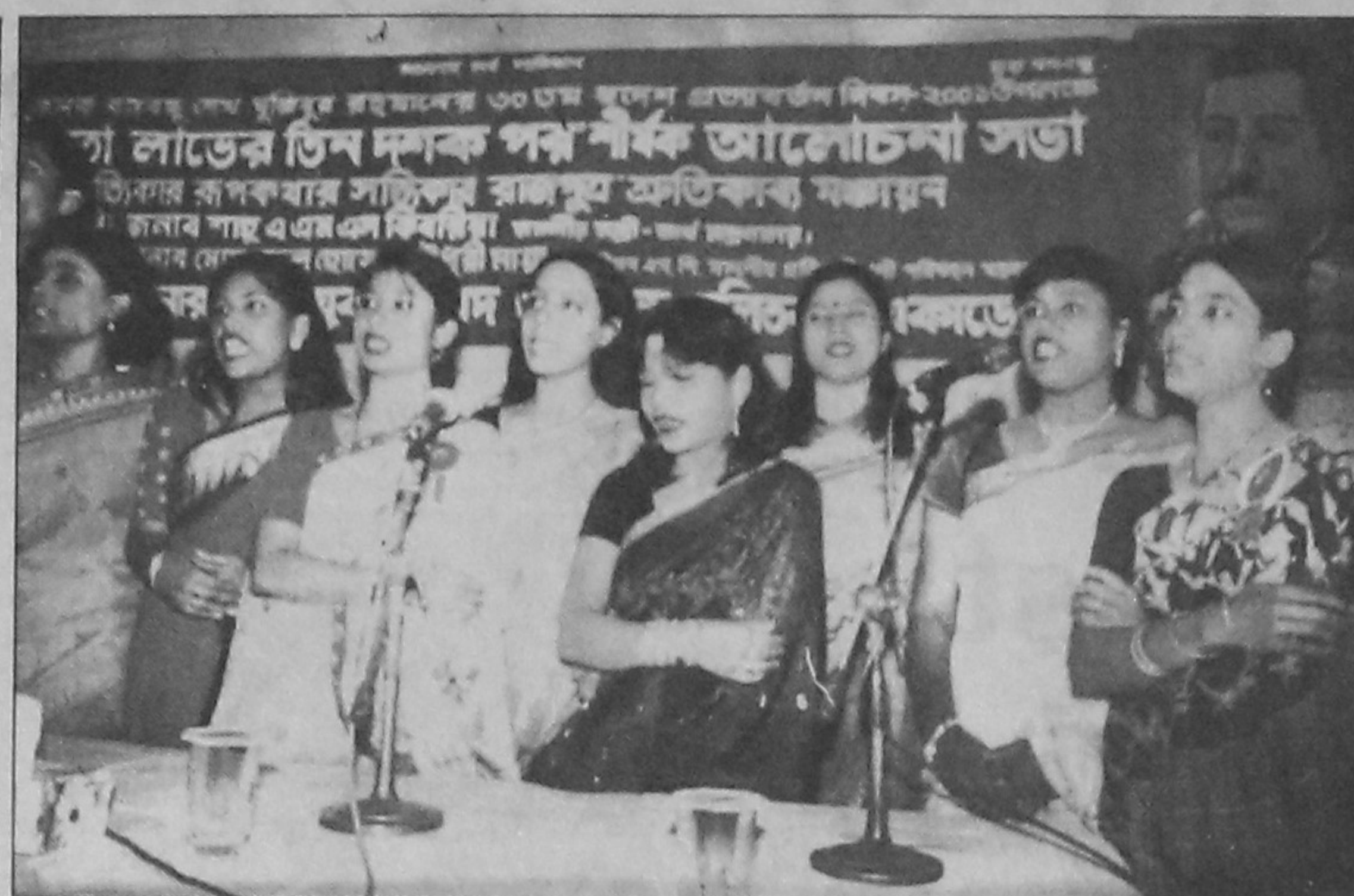
Artists rendering chorus at a function organised by Sonar Bangla Jubo Parishad at the National Press Club yesterday. The programme was held to mark the Home-coming Day of Bangladesh.

Her nama-e-janaza will be held at New DOHS Jame Mosque after Juma prayers on Friday.