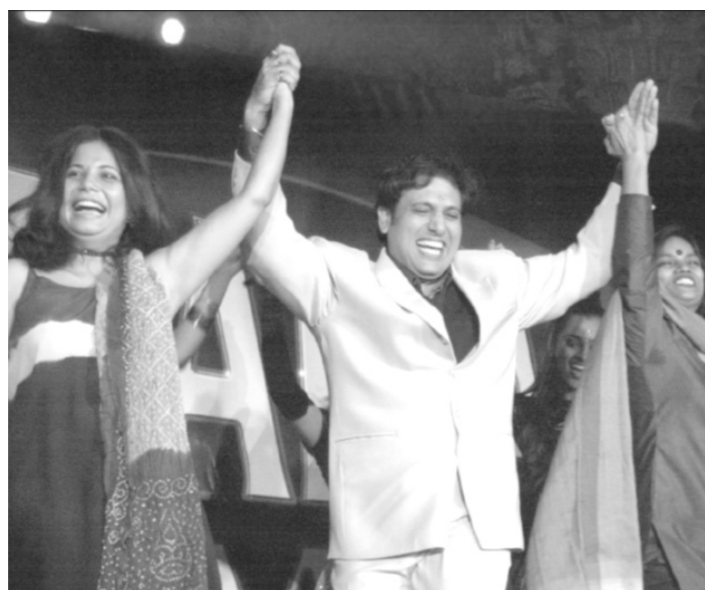
Indian cinema's most mischievous actor Govinda (C) dancing at a launching programme of a television game show 'Jeeto Chappar Phaad Ke' on Monday in south Bombay. The Sony TV game show will go on air on January 26.

In the Santa Tecla area alone, at least 420 people lost their lives in the quake. Of them, 229 were killed by a quake-triggered landslide in Las Colinas.