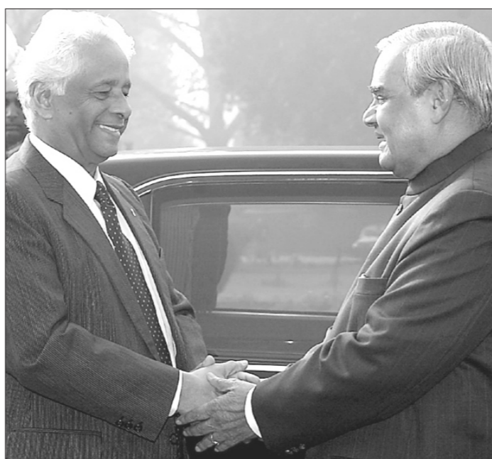
Indian Prime Minister Atal Behari Vajpayee (R) greets his Mauritian counterpart Anerood Jugnauth (L) during a reception at the Presidential Palace in New Delhi yesterday. Jugnauth is in India for a five-day official visit.