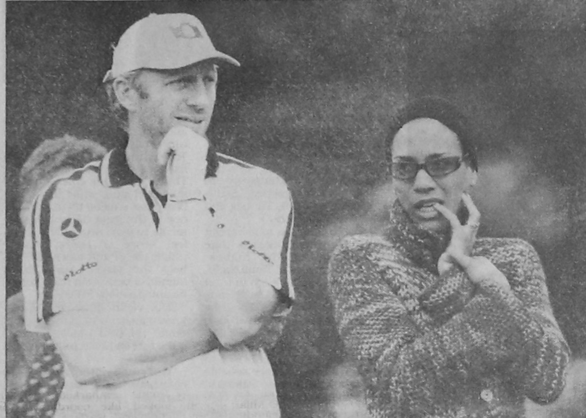
HAPPILY NOT FOR EVER: An AFP file photo of Beckers, Boris (L) and Barbara, shows the couple at a golf tournament in Berlin on May 17, 2000. A German court yesterday granted them a divorce.