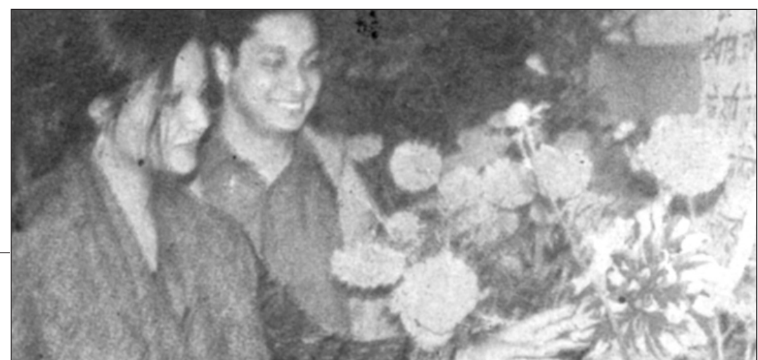
A young couple choosing from a variety of Marigold and Cosmos on show at the exhibition at Sher-e-Bangla Nagar.