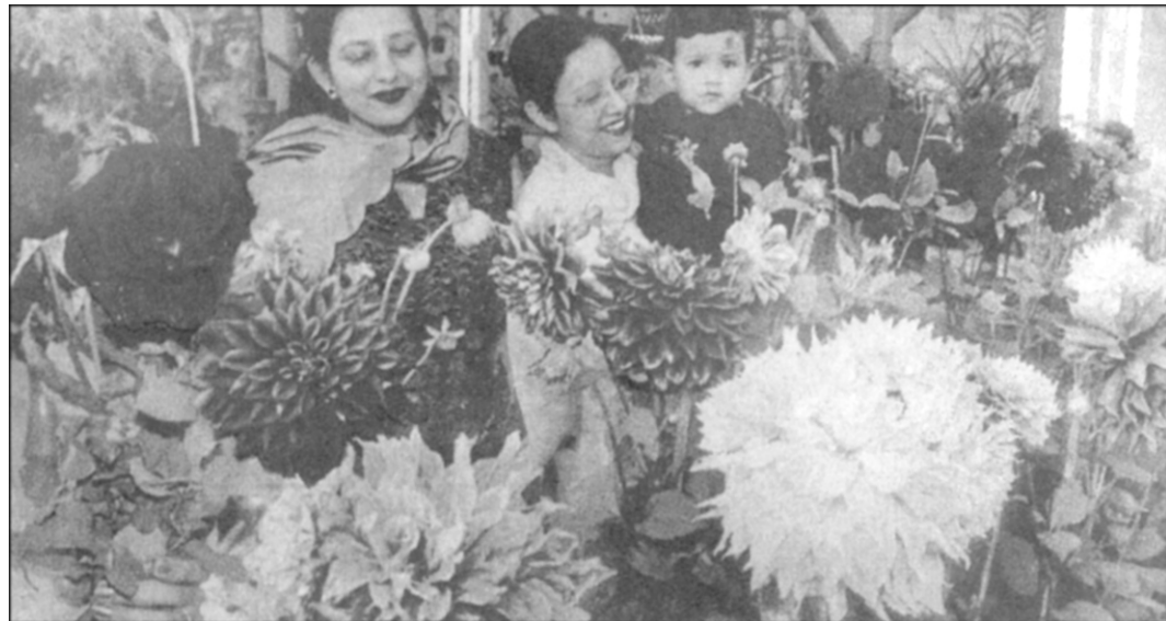
Visitors at the 6th National Flower Show that opened in the city on Friday. The show ends tomorrow.

The most popular variety on display here is the rose. There are over 400 varieties of the rose alone on display here.