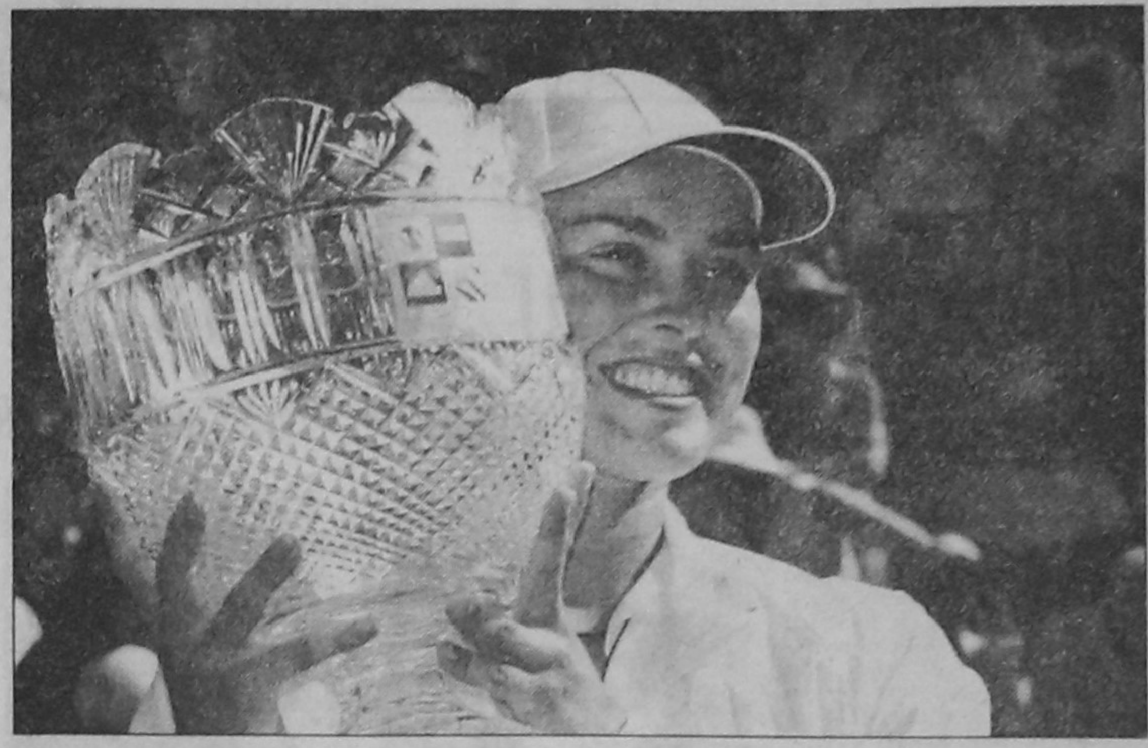
World No 1 Martina Hingis of Switzerland poses with the trophy after beating American Lindsay Davenport in the Sydney International final yesterday.

There are still areas in which I can improve before the Australian Open starts but that in itself is a good sign.