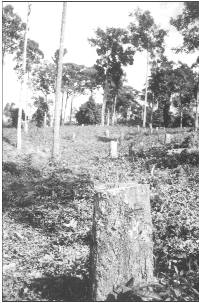
Timber smugglers are active in Bandarban reserve forest. They are cutting trees in such a manner which ultimately hastens the denudation process of the forest.

Official sources said that 63 private property timber permits were issued under Lama Forest Division. In each permit 1,000 cubicfeet of timber, 550 cubicfeet of fire wood and 150 number of logs were permitted for carrying. In the year 1999, 96 private property timber permits containing 1,000 cubicfeet of timber for each owner were granted. Smugglers purchased those permits for carrying on their illegal business with the help of some dishonest forest officials. Government has been losing crores of taka as revenue.