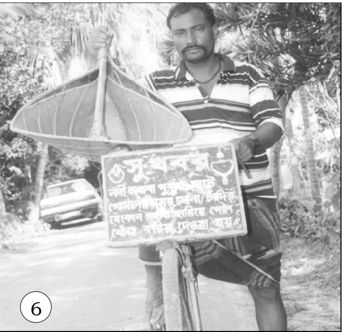
Rural people adopt various ways for earning a living. Pictures on top show (1) a villager hangs a sign board in front of his bicycle which tells that he is an agent who works for others in exchange of commission for buying and selling lands, (2) a man earns money by removing dirt from the ears of his clients, (3) a rural quack standing under a sign board which says he is also engaged in match making for youngsters apart from rendering so-called healthcare service to poor people. Bottom pictures show (4) a man sitting beside a road temporarily cures rheumatoid arthritis of co-villagers by applying shock therapy, (5) a villager charming people by playing a flute, which he carries in large number inside a bag for sale and (6) the man with a trap traces out missing valuables from ponds or other water bodies. He gets one third of the valuable item as his reward of labour if he successfully finds the same.