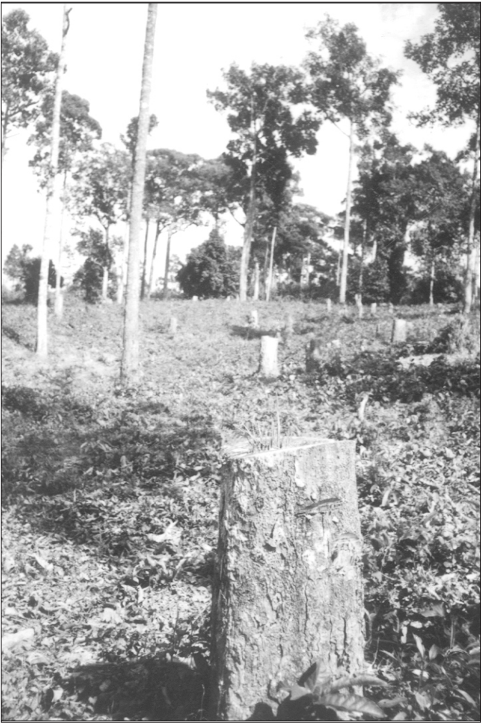
Timber smugglers are active in Bandarban reserve forest. They are cutting trees in such a manner which ultimately hastens the denudation process of the forest.

violation of forest act are going on in the brick fields of Bandarban. Timber and fire wood are being burnt instead of coal in the brick fields, valuable timber and fire wood amounting to Taka four crore are being burnt in the brick fields of the district in a year. Valuable and immature trees are also being used for burning bricks. Timber smugglers supply timber in the fields at night. In this season 25 brick fields have been established in the district and the owners have collected a huge quantity of timbers and firewood. About 50 thousand maunds of firewood are needed in a brick field to burn in a season. Some brick fields are also established near the