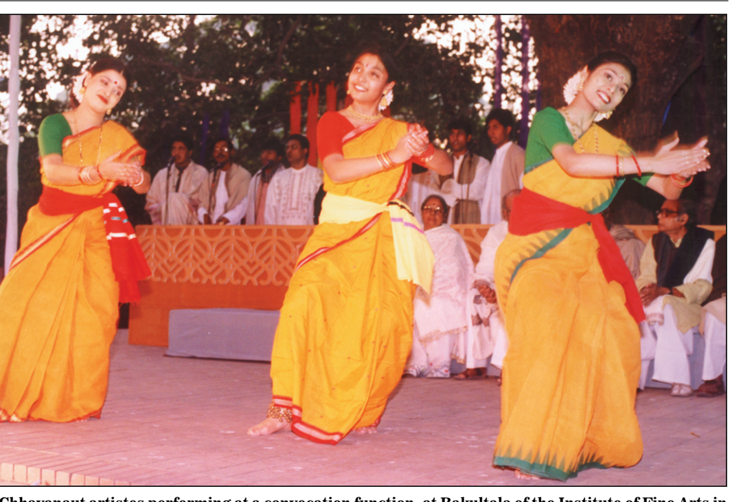
Chhayanaut artistes performing at a convocation function at Bakultala of the Institute of Fine Arts in