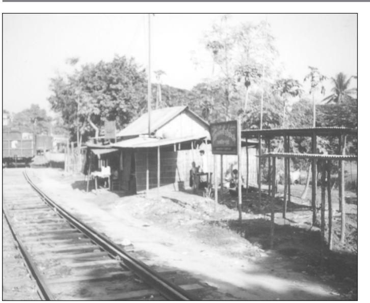
A section of influential people build many illegal structures on railway lands in Sirajganj Bazaar Railway Station area.

Fed-up with the growing trend of barbarism, a good number of people have already left the union in the last few years, locals said