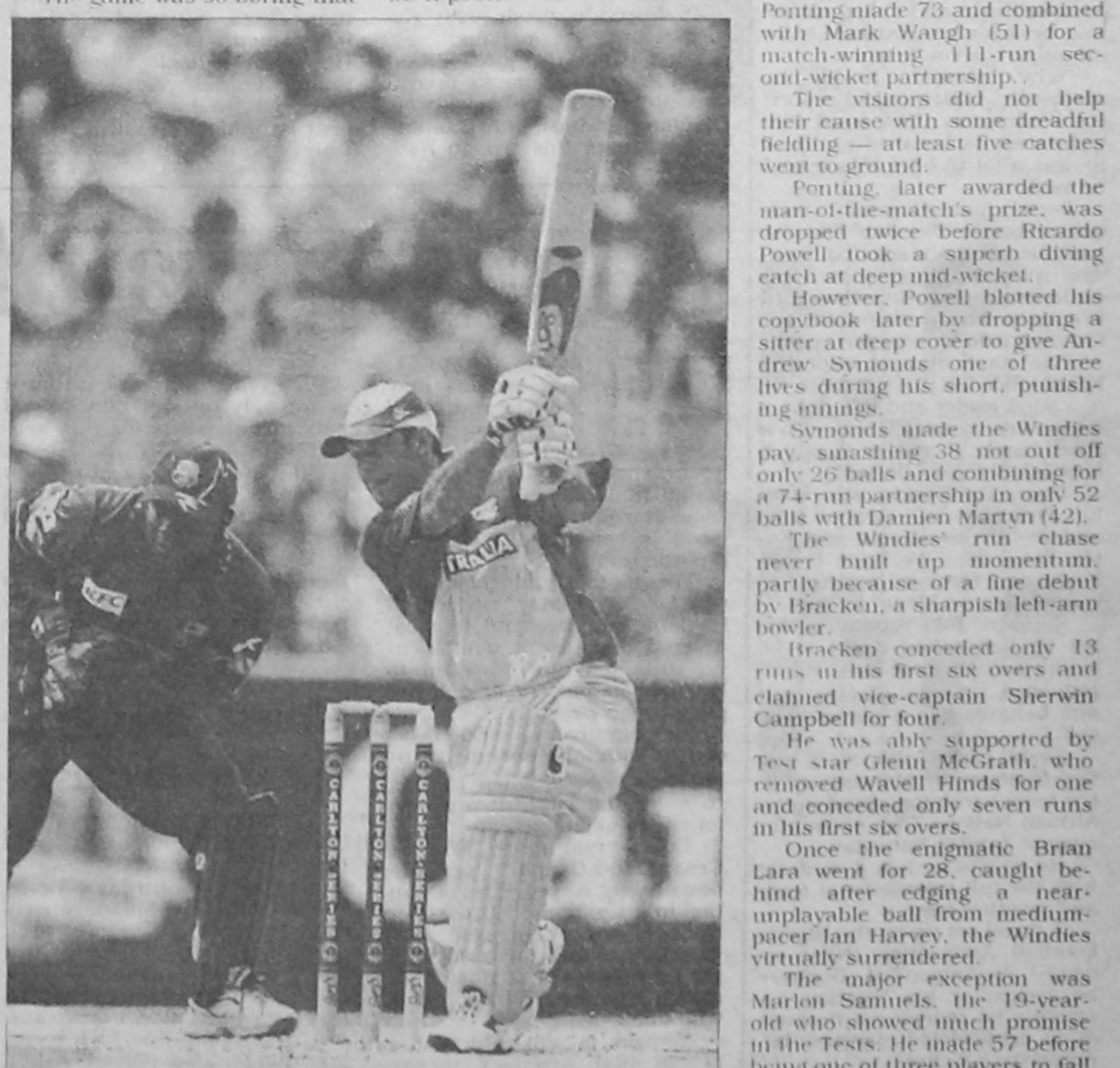
MAN-OF-THE-MATCH: Star Australia batsman Ricky Ponting follows through on a cover-drive during the opening match of the Carlton one-day series against West Indies at MCG yesterday.