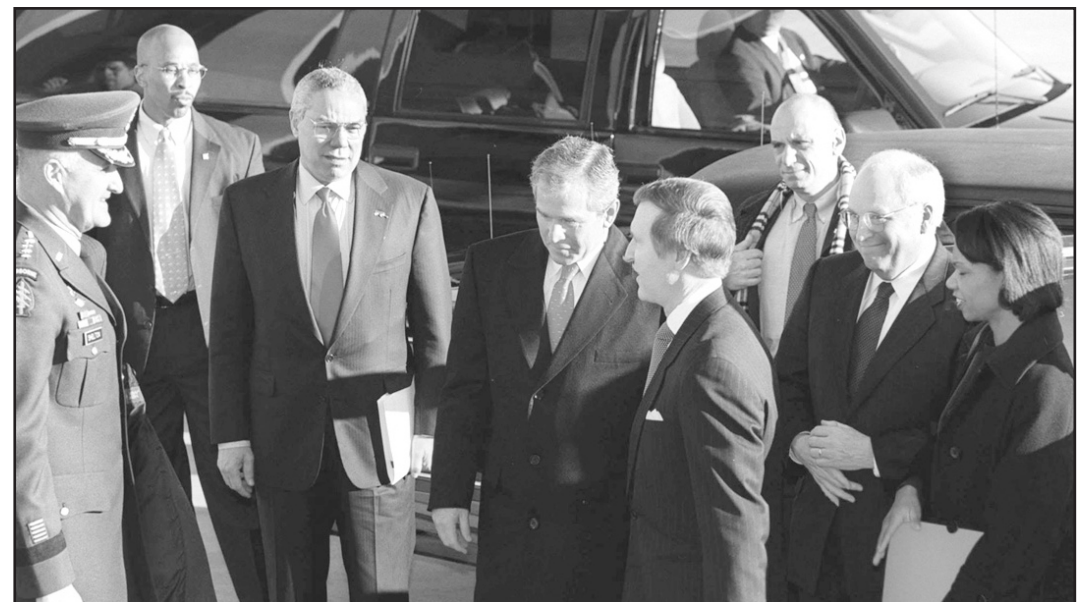
US President-elect George W. Bush (C) is greeted on his arrival at the Pentagon by Secretary of Defence William Cohen and Chairman of the Joint Chiefs of Staff, General Hugh Shelton on Wednesday. With them is Secretary of State-designate Colin Powell (2ndL), Vice president-elect Dick Cheney (2ndR) and National Security Advisor Condoleezza Rice (R).

"Her return will be a welcome sign for politics," senior PML leader Raja Zafarul Haq told AFP. "Political leaders' presence in the country is needed."