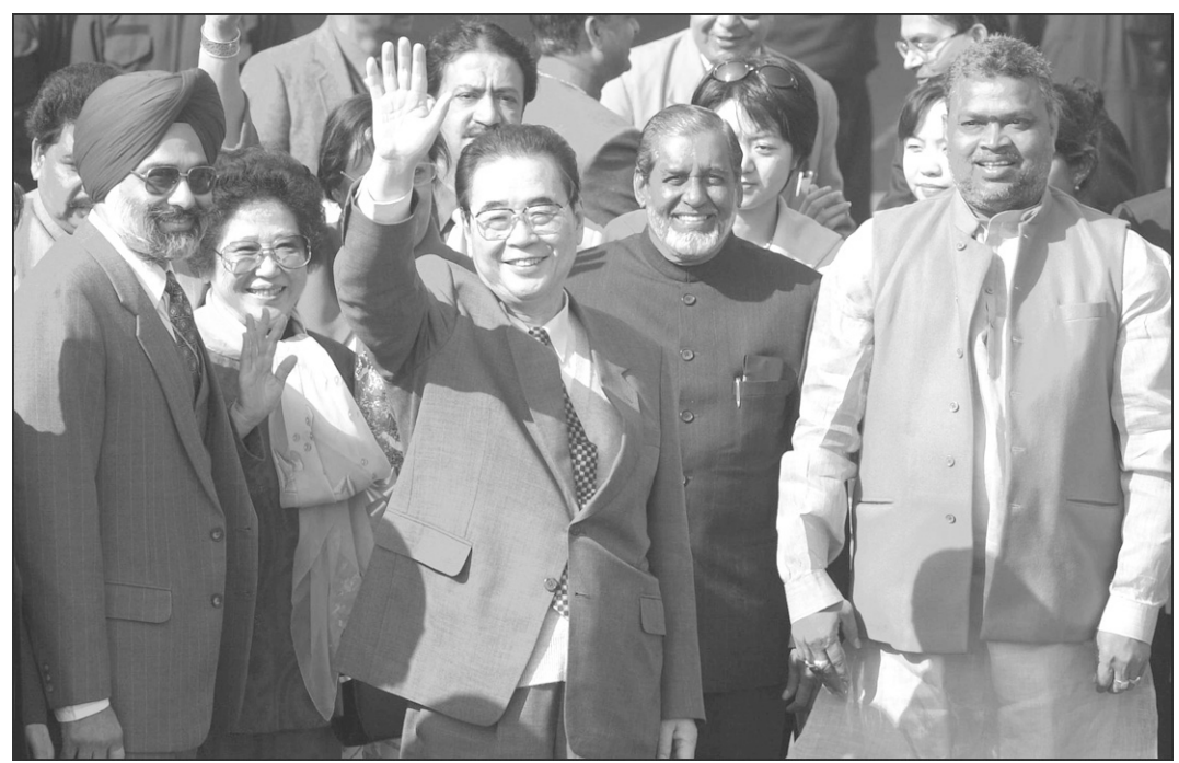
Chairman of China's National People's Congress Li Peng (C), surrounded by Indian officials, waves to photographers upon his arrival in New Delhi yesterday. Li is on a nine-day official visit to India.

A heavy security cordon was thrown along the entire route from the airport to the hotel, which was guarded by several police detachments.