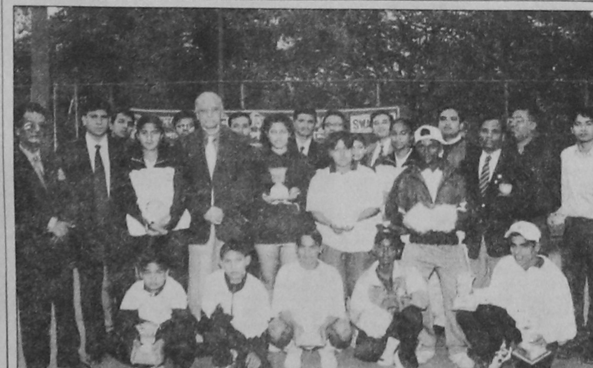
Winners of the Shwadesh Open tennis championships pose with their trophies after the prize-giving ceremony on the concluding day at the Ramna National Tennis Complex on Tuesday.

ON P Z K F O J R D W D O R P Yesterday's Cryptoquip: THE WOODSMAN CLAIMED THAT BEING A LUMBERJACK IS JUST BARK-BREAKING WORK. Today's Cryptoquip Clue: P equals M