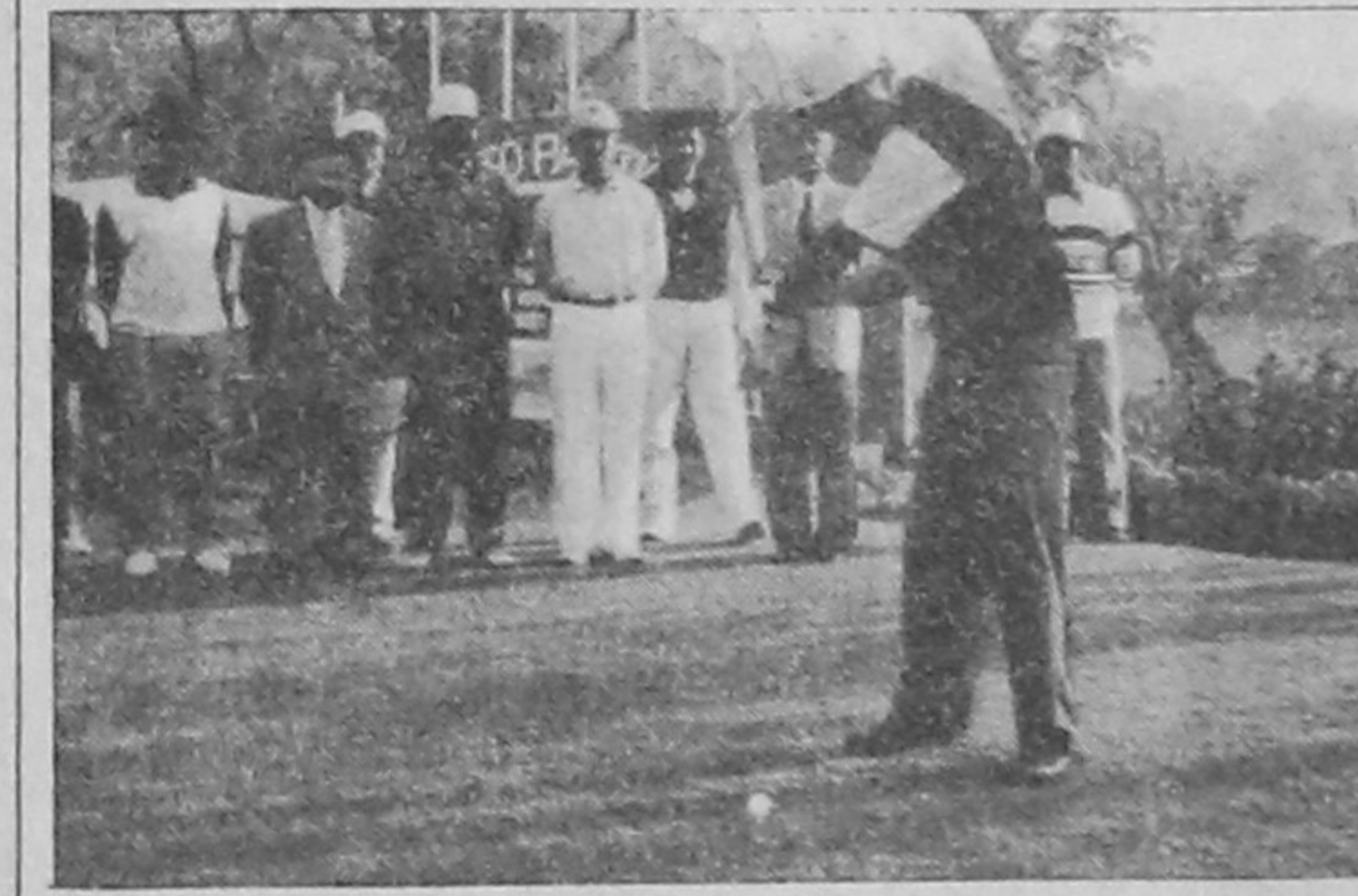
Chief of Army Staff Lt Gen M Harun-Ar-Rashid teeing off the five-day Bhatiary Open golf tournament, the first ever professional meet to be held in the country, at the Bhatiary Golf and Country Club in Chittagong on Tuesday.