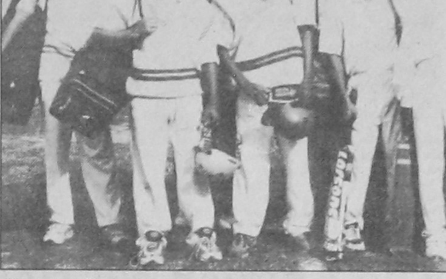
Players of Dhaka Rangers and Khulna Rupsha pose for photographs after their Milo Under-13 cricket tournament match at the Kalabagan Cricket Club ground yesterday.