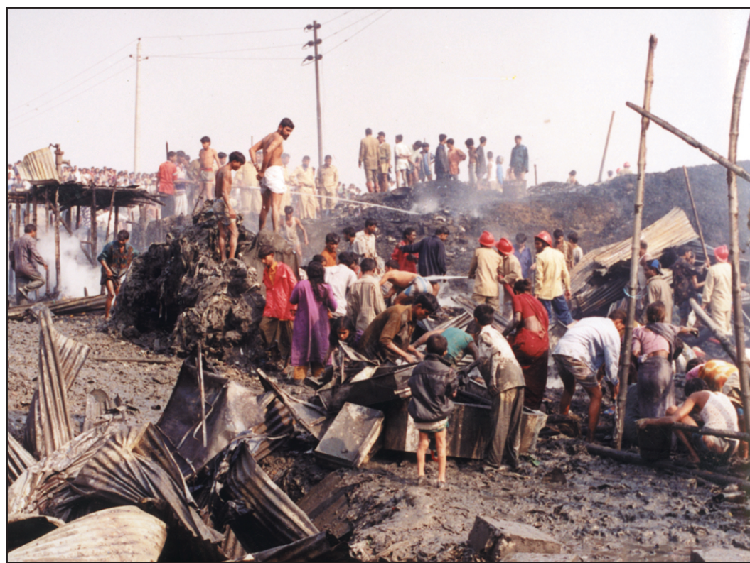
More than 100 shanties were gutted in a fire at a slum at Kallarbagh in the city's Lalbagh area yesterday.

State Minister for Culture and Sports Obaidul Qader and the newly appointed chief of army staff Lt Gen Harunur Rashid also addressed the function. Engineering Chief Maj Gen Hafiz Molliq briefed the Prime Minister on the project, which was completed under the supervision of Military Engineers Services of Bangladesh Army.