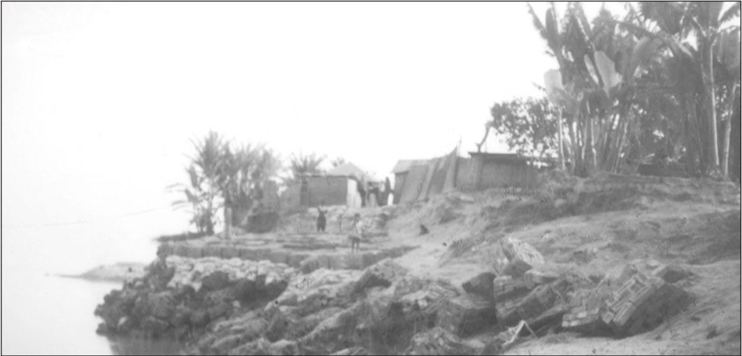
Inferior quality of work has been done in the name protecting land and property from the Jamuna erosion by Sirajganj Water Deveopment Board (WDB) at Vatpiari under Sadar upazila in Sirajganj district.

Recently Grameen Bank is giving loans among the pottery industry owners.