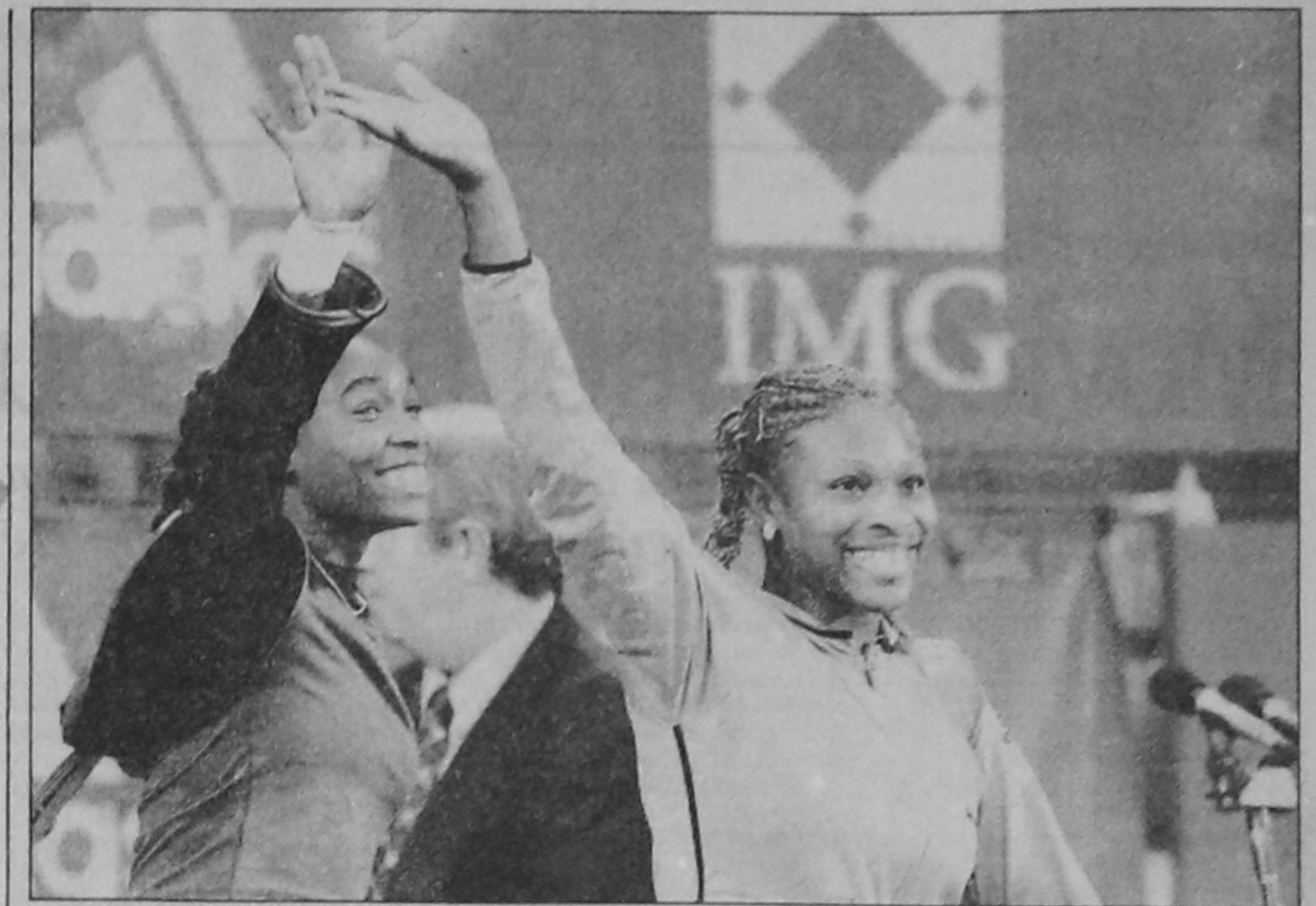
Williams sisters Venus (L) and Serena wave to the crowd as they arrive to play their doubles match against Martina Hingis and Monica Seles in Sydney.