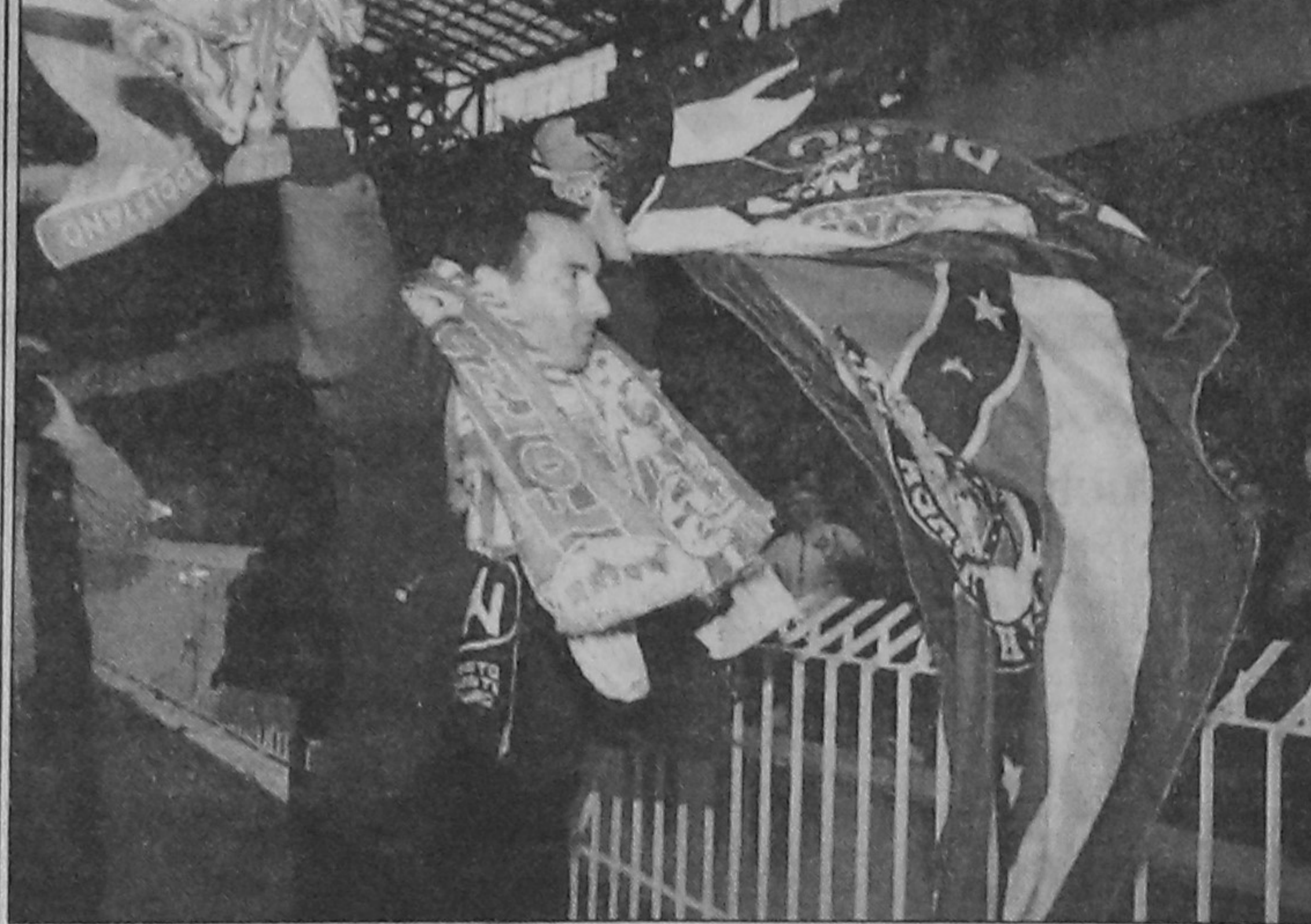
Brazilian soccer star Edmundo waves to Napoli fans at the San Paolo's Stadium on January 8.

RIO DE JANEIRO, Jan 9: Brazilian league finalists Sao Caetano and Vasco da Gama must play a third match on January 18 to determine who takes the title after the return leg was abandoned when a fence collapsed, injuring some 160 people, reports AFP.