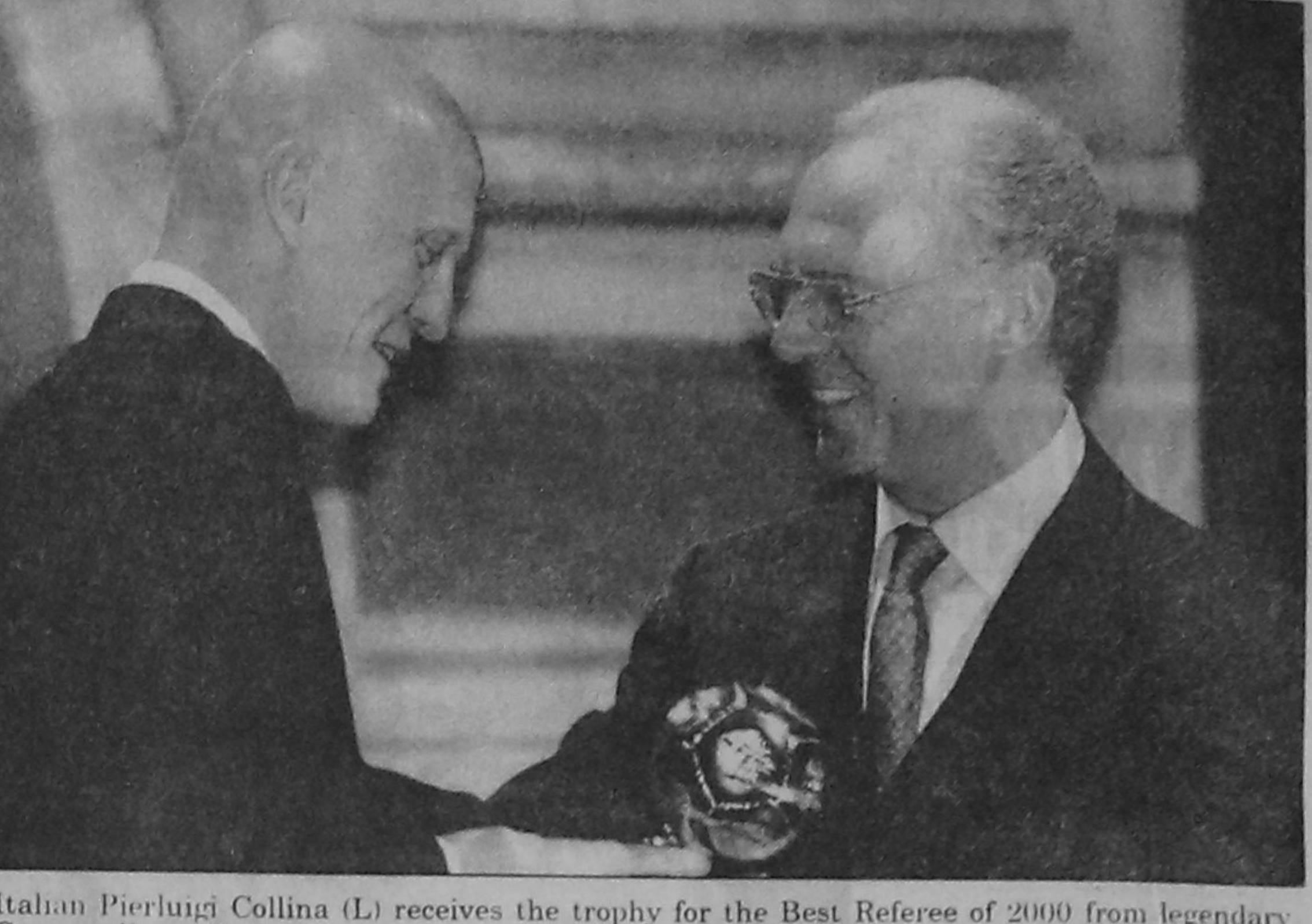
Italian Pierluigi Collina (L) receives the trophy for the Best Referee of 2000 from legendary German Franz Beckenbauer in Rotenberg on January 9. International Football Federation of History and Statistics (IFFHS) hosted the function.