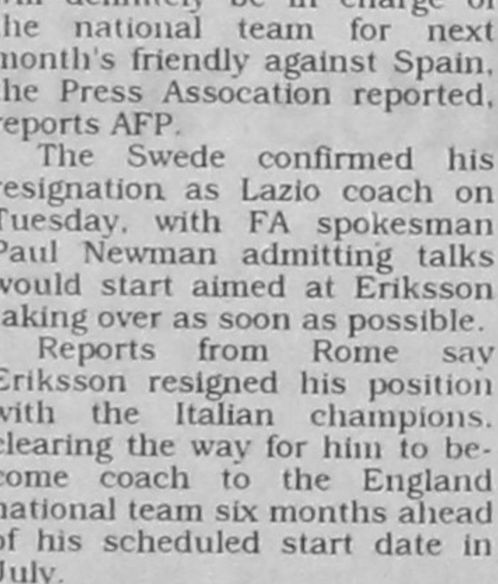
SVEN GORAN ERIKSSON

He has also won many other trophies with Lazio and during earlier Serie A assignments with AS Roma, Fiorentina and Sampdoria as well as three Portuguese titles with Benfica.