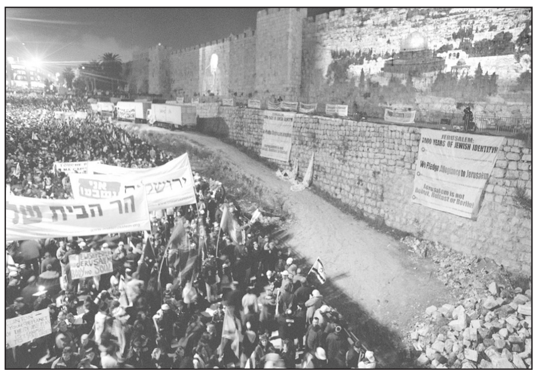
Tens of thousands of Israelis, many of them Jewish settlers or members of the right-wing, gather at Jerusalem's Old City Jaffa Gate on Monday as a picture of the Dome of the Rock is projected on the ancient walls, during a rally against dividing the Holy City in order to reach a peace deal with the Palestinians.