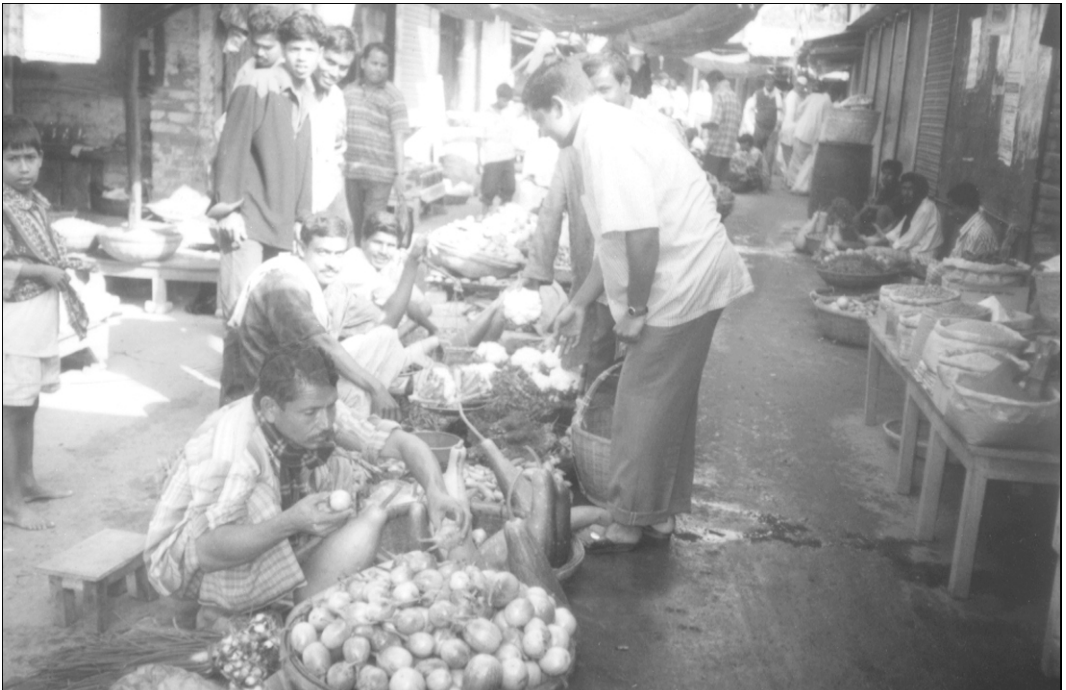
Vendors display vegetables at a bazaar in Sirajganj town. Locals say prices are comparatively high this winter.

Some channels are too narrow for the vessels to negotiate. Immediate dredging in these channels is a must to keep the navigation in operation otherwise navigation in these channels will suffer greatly in a months of February and March when the water levels in the rivers Padma and Jamuna fall further. The road communication between the capital city and south-western districts of the country will be snapped if the navigation between Aricha and Daulatdia ghats is not kept running. Thousands of road transports carrying passengers and goods are being ferried every day from Aricha to Daulatdia and vice versa. The intensity of the on-going dredging in the rivers Padma and Jamuna from Aricha to Daulatdia ghat needs to be accelerated in a planned way so that the navigation in the said route continues. According to official source, four dredgers have been al-work to maintain the navigation of the route. The eight Kilometers long way of this route starting from Daulatdia ghat is very risky.