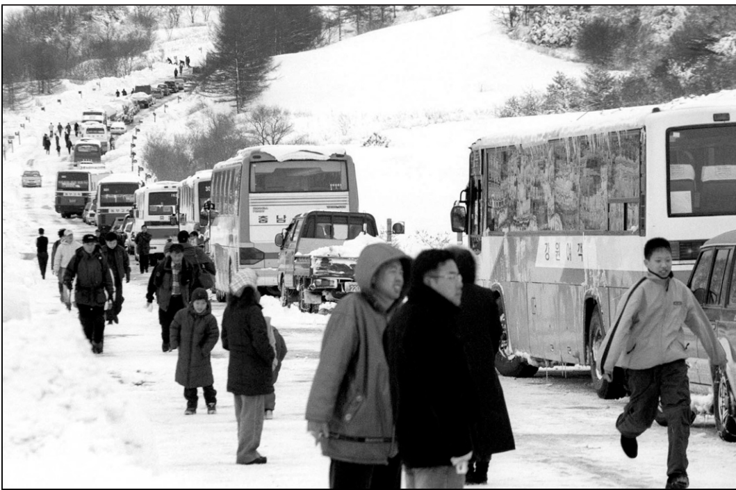
South Korean passengers from buses await rescue workers on a snow-covered highway in Kangnung, some 237 km east of Seoul, yesterday, a day after heavy snowfalls. It was the heaviest snowfall of the season in the central part of the country.

ROME, Jan 8: The US embassy in Rome, closed on Friday over security fears, was reopened today, reports AFP. A press release said that after reassessing the security situation, authorities decided to open the embassy's doors to the public again. The US State Department announced Friday that the embassy would close until further notice. According to diplomatic sources, US authorities feared an attack by an armed Islamic unit. Italian news agency Asna cited Italian security sources as saying that a group intended to launch a laser-guided missile attack on the embassy building. Security measures remained tight at Rome's Fiumicino airport on Monday while all Italian-based US military and civil authorities also maintained a heightened state of alert.