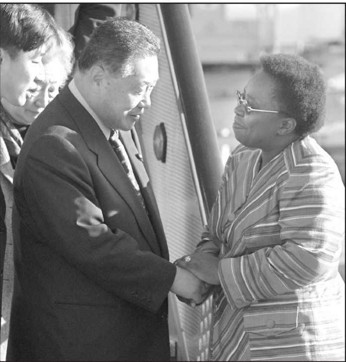
Japanese Prime Minister Yoshiro Mori (C) is welcomed by the South African Foreign Minister Nkosazana Zuma upon his arrival at the Johannesburg International airport yesterday. Mori is on a three-day visit to South Africa.

Five mortar shells hit Tehran: Five mortar shells hit northern Tehran on Sunday but there were no reported injuries in the attack, the state IRNA news agency said, AFP reports from Tehran. An AFP photographer on the scene said the shells appear to have been fired from an empty plot of land just northwest of Vanak Square, a major plaza in the capital. IRNA said security forces were still investigating the incident. Gas tanker blast kills 12 in India: At least 12 people were burned to death when a gas tanker collided with a truck Sunday near the northern Indian city of Kanpur, the United News of India said, AFP reports from New Delhi. The police said six others were seriously injured when the tanker carrying inflammable gas exploded in a ball of fire after ramming the stationary truck in Bara village near Kanpur. The victims were killed instantly, a Kanpur police spokesman said.