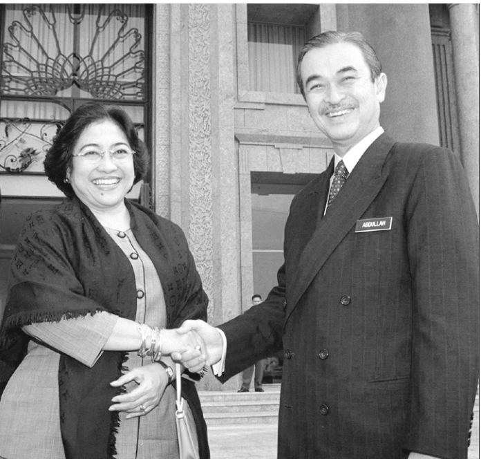
Indonesian Vice President Megawati Soekarnoputri (L) is greeted by Malaysian Deputy Prime Minister Abdullah Ahmad Badawi at Putrajaya on the outskirts of Kuala Lumpur yesterday. Megawati is in Malaysia on a three-day official visit to strengthen bilateral ties between both coun-