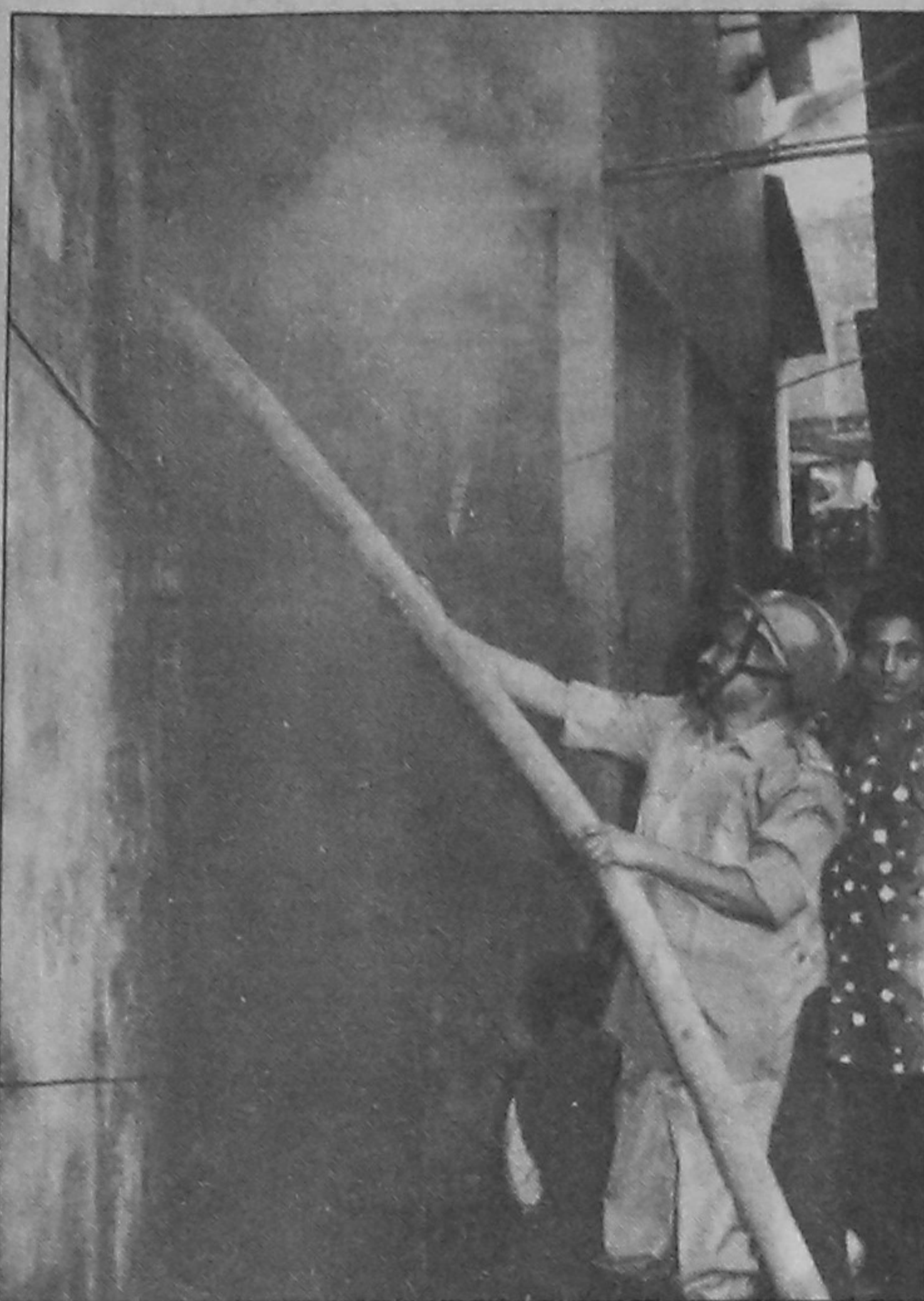
Firefighters trying to douse a fire that broke out at Sir Saifulullah Medical College Hostel yesterday.