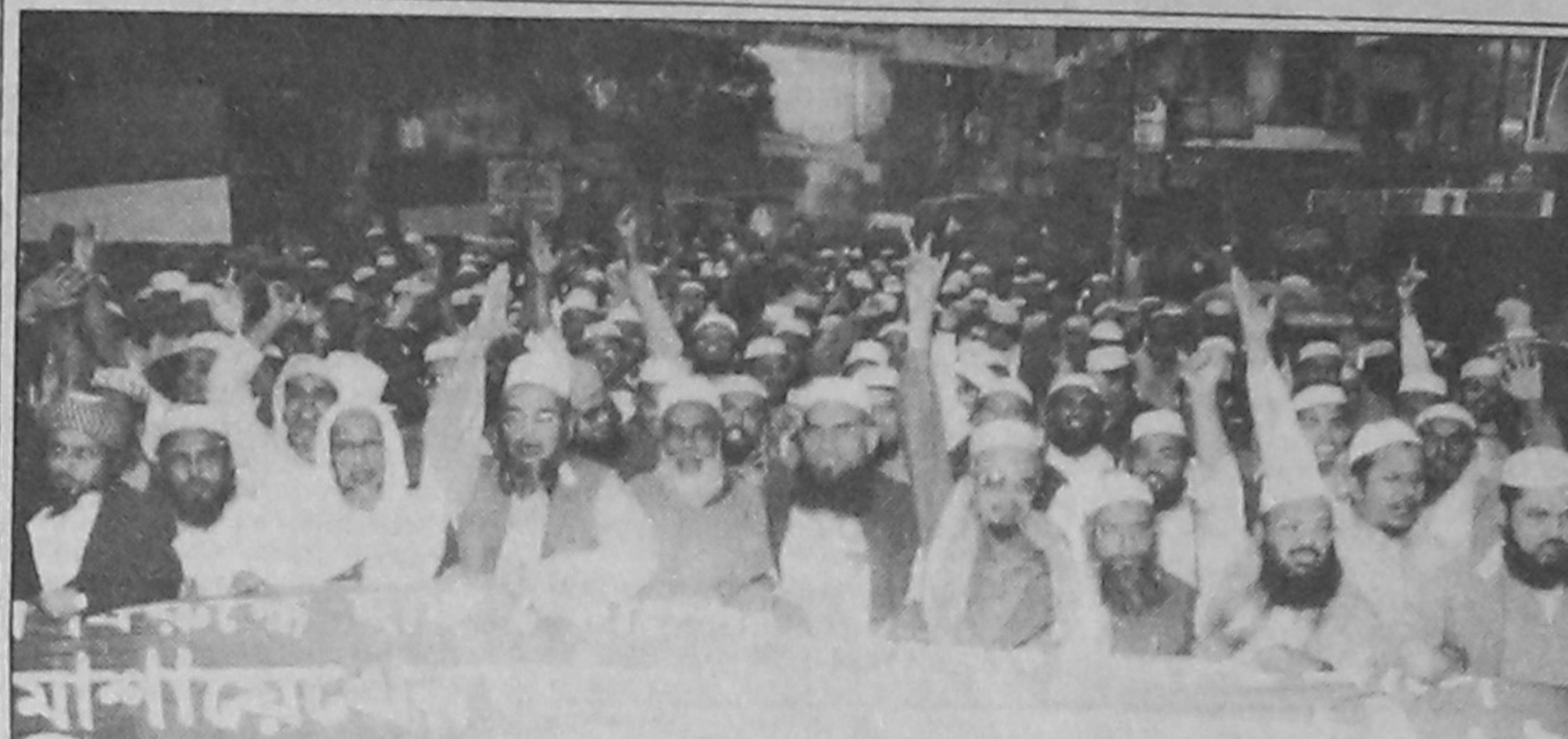
Fundamentalist activists under the banner of Jatiya Mohasamabesh Bastobayon Committee brought out procession in the city yesterday. They denounced the HC verdict against fatwa and called on all people make their upcoming grand rally a success.

Bangladesh generally faces cyclonic storm before and after monsoon periods like April-May and November-December. According to worldwide data, around 70-80 cyclonic storm generates in the tropical zone and around seven per cent of them originates from the Bay of Bengal and hit Bangladesh coast leaving a trail of destruction of lives and properties.