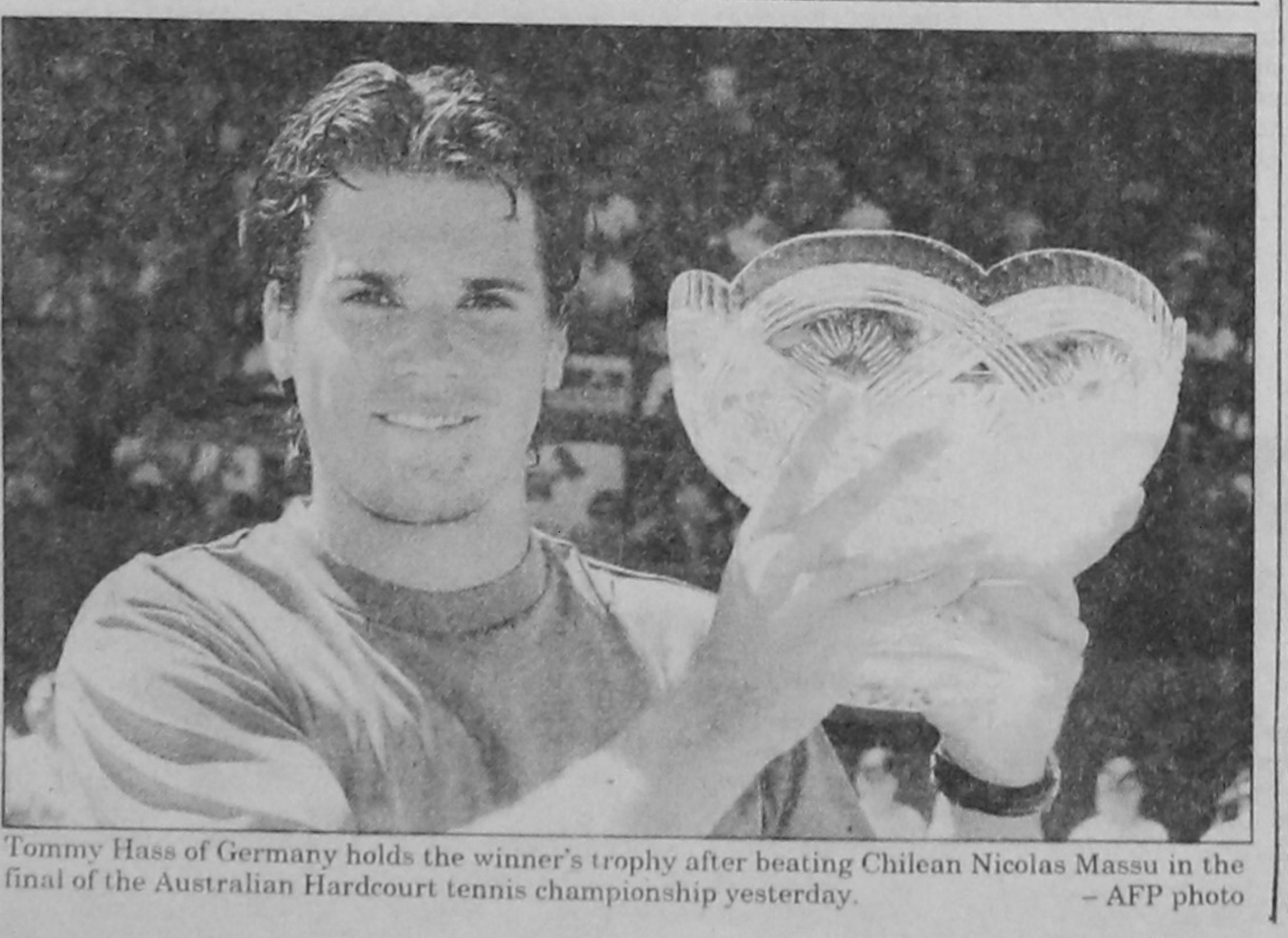
Tommy Haas of Germany holds the winner's trophy after beating Chilean Nicolas Massu in the final of the Australian Hardcourt tennis championship yesterday.

SYDNEY, Jan 7 (AFP). Serena Williams is convinced she and her sister Venus have taken tennis to a new level. The Williams sisters have taken the tennis world by storm in recent years, with Venus last month signing the richest sponsorship deal in women's sporting history.