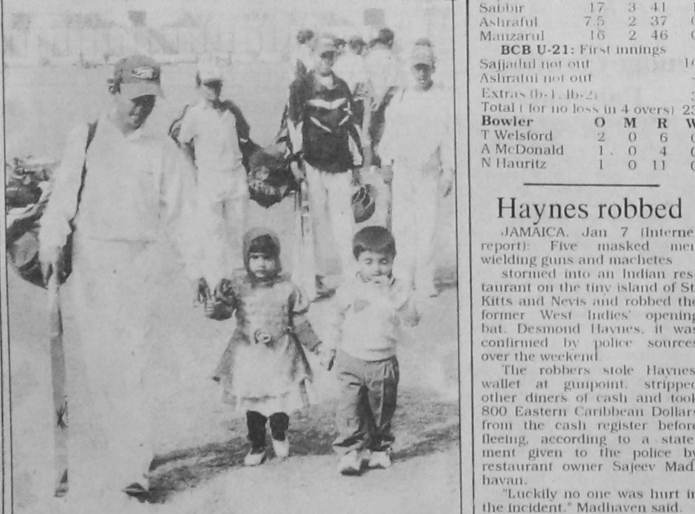
TWIN FANS A youngster (L) who participated in the Bangladesh Cricket Board's (BCB) coaching clinic for aspiring cricketers at the Bangabandhu National Stadium, leaving the ground with his twin siblings on January 6.