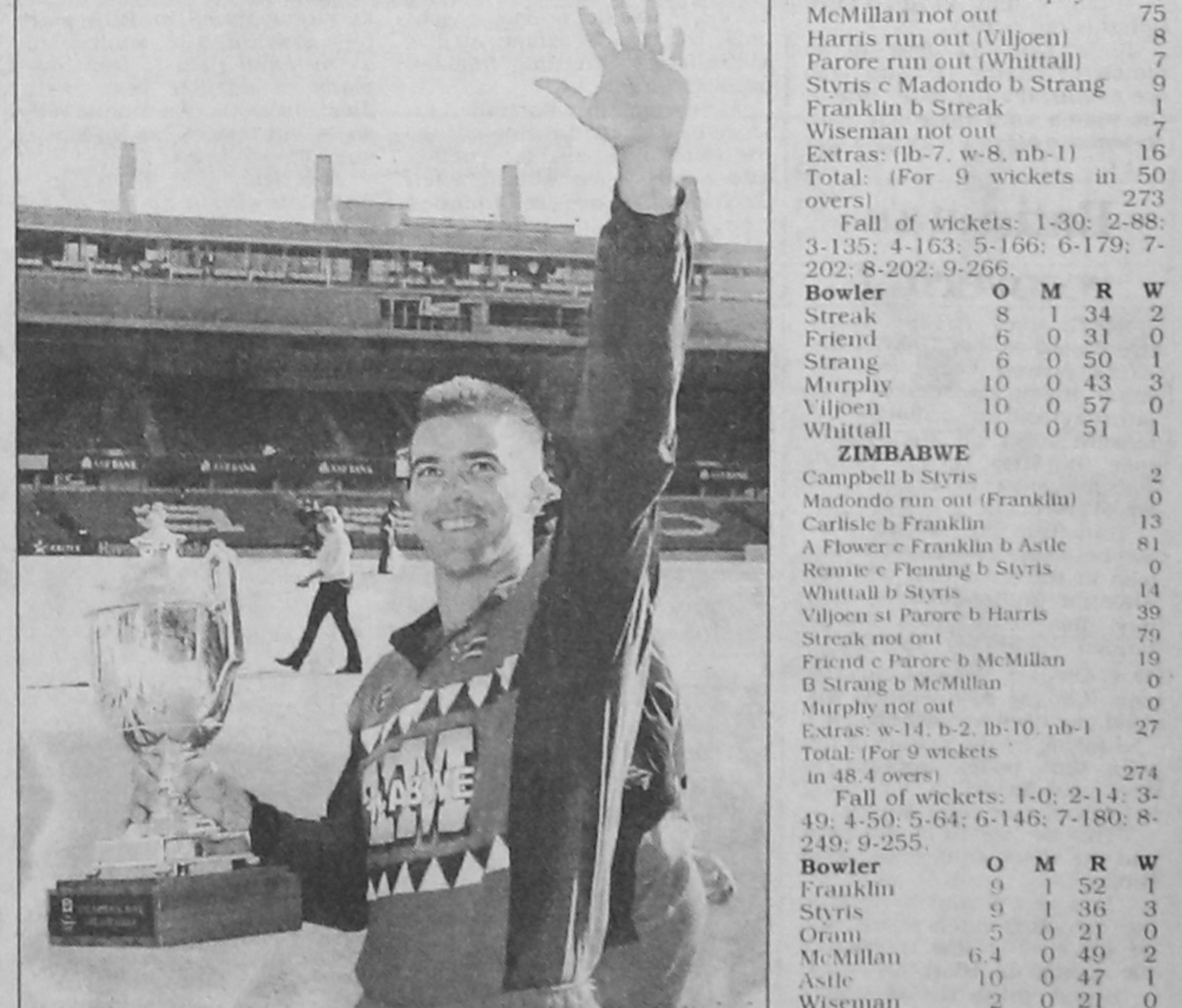
Zimbabwe captain Heath Streak waves to the fans with the National Bank trophy after beating New Zealand in the third and final one-day yesterday.