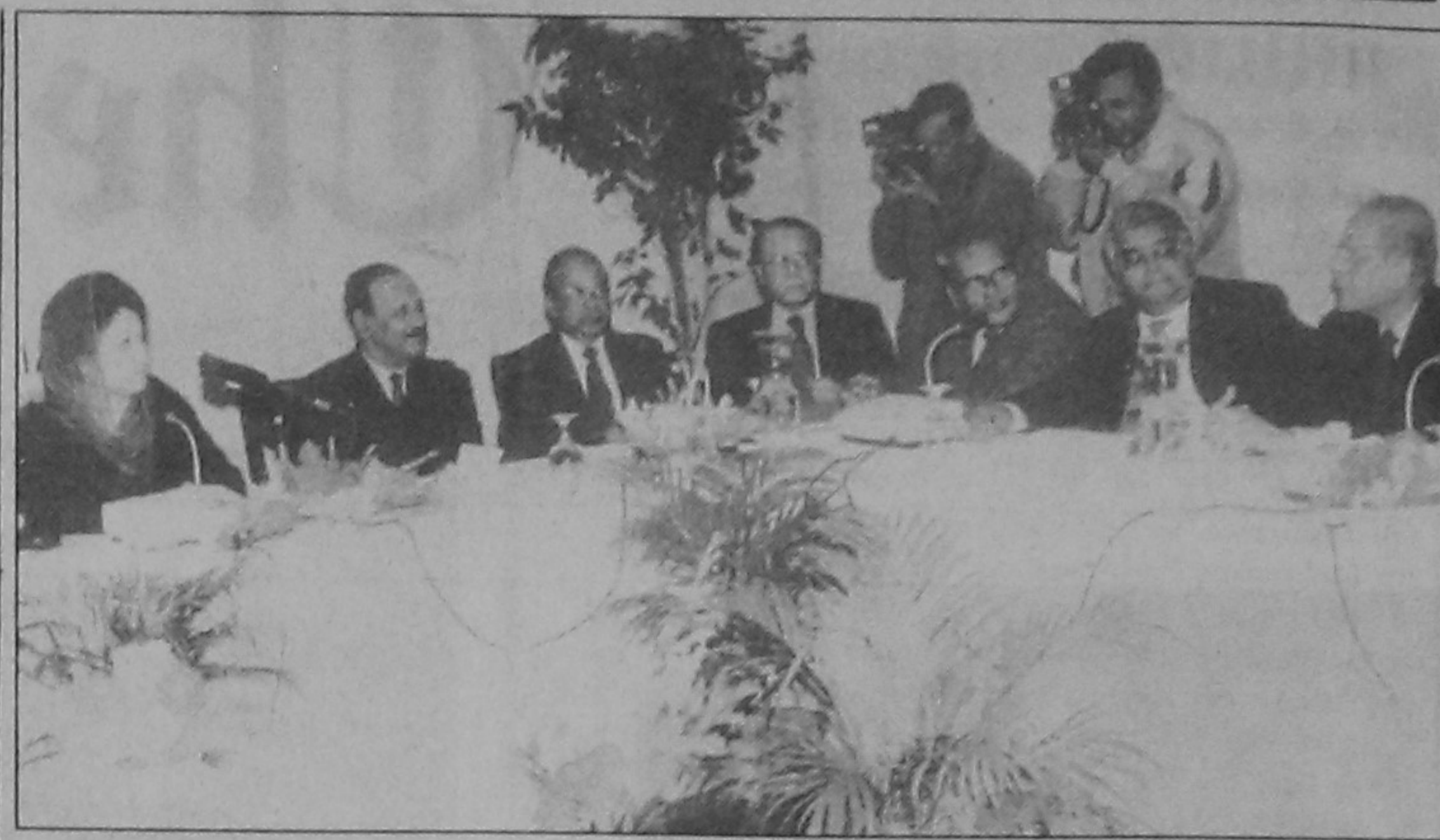
Leader of Opposition in Parliament and BNP chairperson Khaleida Zia exchanging views with editors of national dailies at news agencies at Hotel Sheraton yesterday.

Presided over by convener of the Ojika Parishad Shahnawaz Dulal, the meeting was also addressed by DUJ, DFUJ leaders who demanded immediate resumption of the publication of the daily.