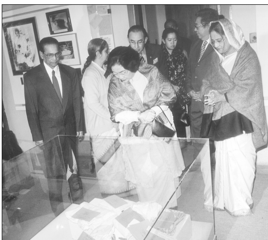
Visiting Indonesian Vice President Megawati Soekarnoputri visited Bangabandhu Memorial Museum in the city's Dhanmondi area yesterday. Prime Minister Sheikh Hasina accompanied her.

But this will be the final bite of the winter, he said about the third wave since cool weather settled in from last month with a mild cold wave.