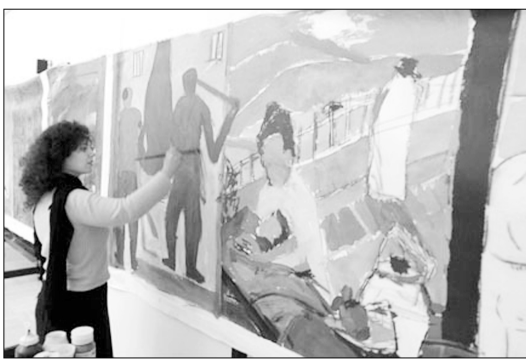
A Lebanese artist paints on a tableau at the UNESCO Palace in Beirut on January 5. Arab artists are putting together a giant mural to dramatise the Palestinian uprising, with painting of everything from stone-throwing children to a sun shining over landscape.