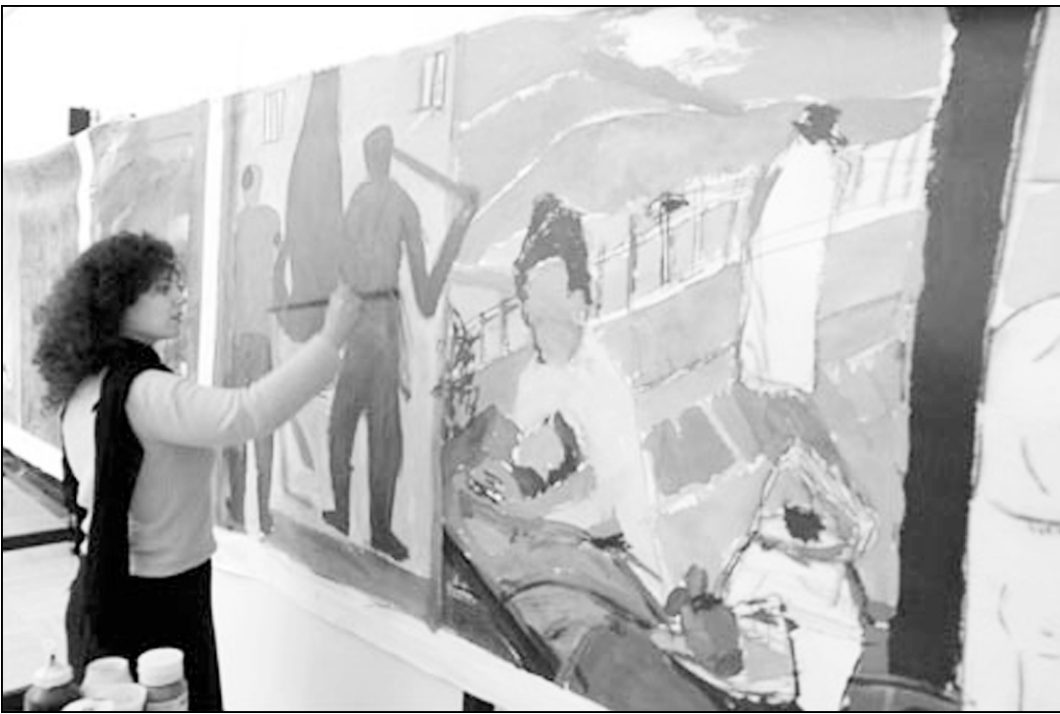
A Lebanese artist paints on a tableau at the UNESCO Palace in Beirut on January 5. Arab artists are putting together a giant mural to dramatise the Palestinian uprising, with painting of everything from stone-throwing children to a sun shining over landscape.