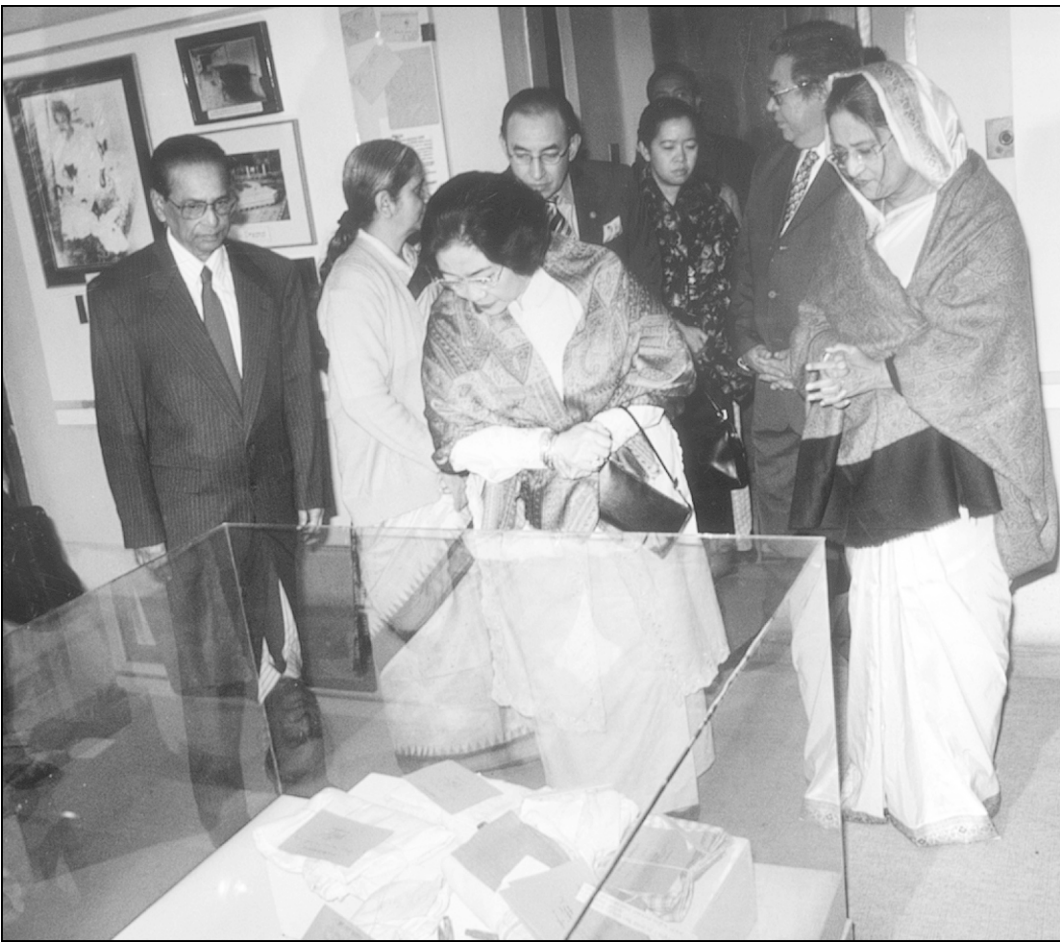
Visiting Indonesian Vice President Megawati Soekarnoputri visited Bangabandhu Memorial Museum in the city's Dhanmondi area yesterday. Prime Minister Sheikh Hasina accompanied her.