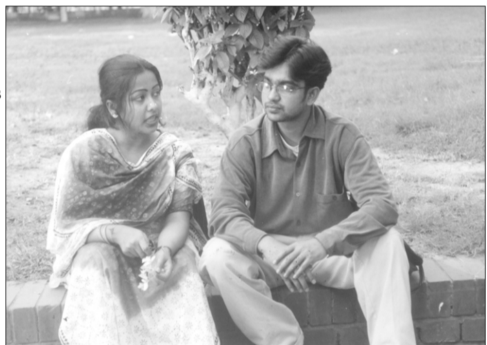
A still from the new serial in making 'Nai telephone, naire peon'

The fact that the relocation of these poor people is not the last leg of rehabilitation is what is emphasised in this documentary. Life in most of the new places they