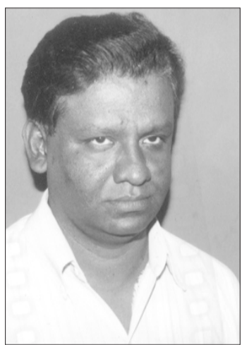
The maker: Mahabub Alam

THE problem of homeless people in the city is not a new one. Different natural calamities lead to accumulation of floating people in the city who come to the metropolitan in search of a livelihood.