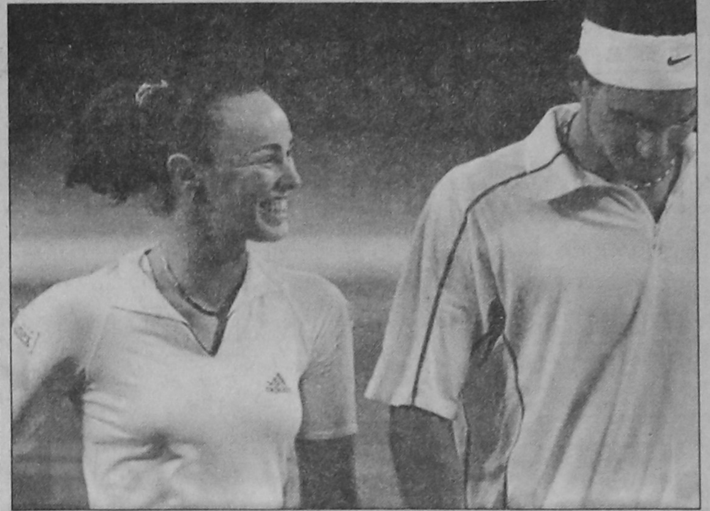
Swiss mixed doubles pair of Martina Hings (L) and Roger Federer is jubilant after beating South Africans Amanda Coetzer and Wayne Ferreira at the Hopman Cup in Perth yesterday.