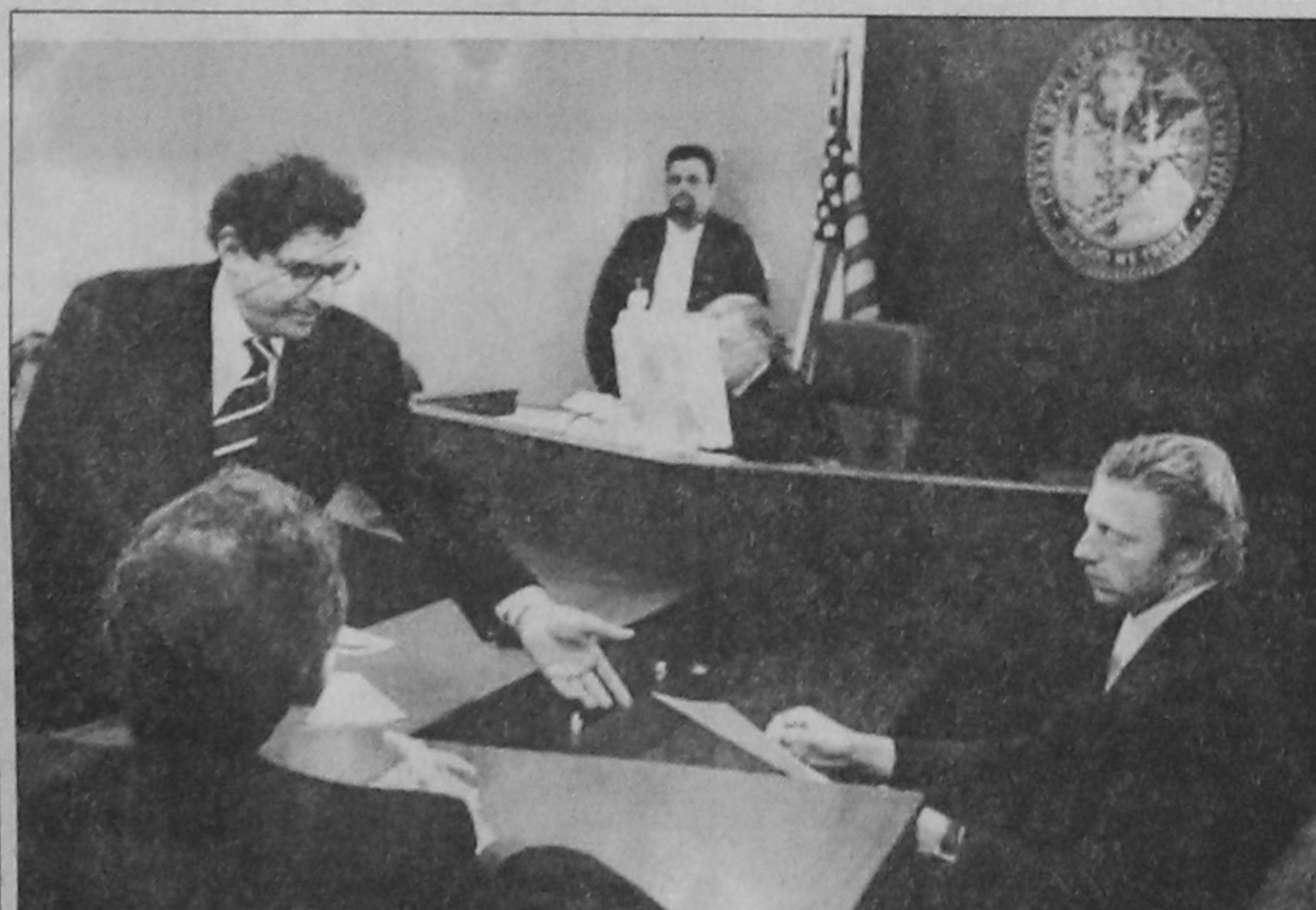
Former German tennis great Boris Becker (R) looking into a document presented to him by his wife lawyer during a hearing at the Miami-Dade Court on January 4.

Today's Cryptiquip Clue: S equals A The Cryptiquip is a substitution cipher in which one letter stands for another. If you think that X equals O, it will equal O throughout the puzzle. Single letters, short words and words using an apostrophe give you clues to locating vowels. Solution is by trial and error.