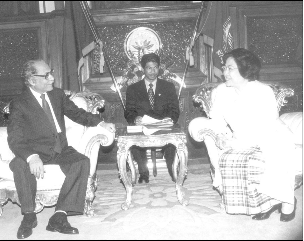
Indonesian Vice-President Megawati Soekarnoputri called on President Justice Shahabuddin Ahmed at Bangabhaban yesterday.