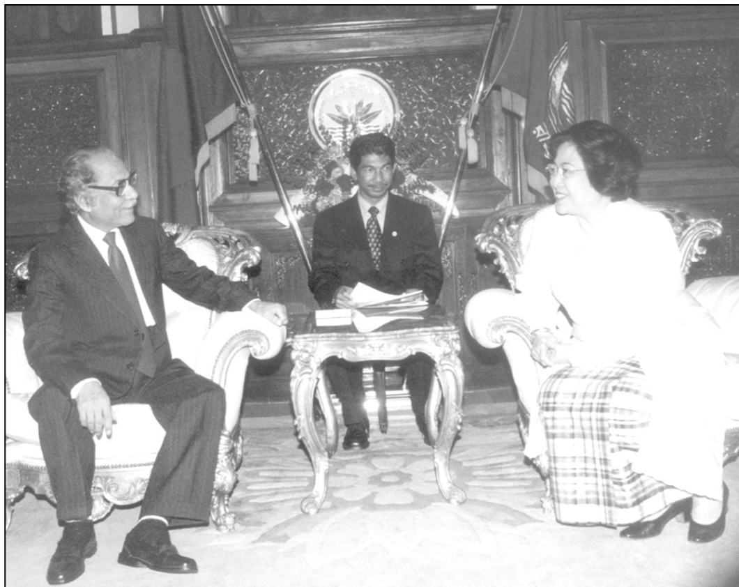
Indonesian Vice-President Megawati Soekarnoputri called on President Justice Shahabuddin Ahmed at Bangabhaban yesterday.