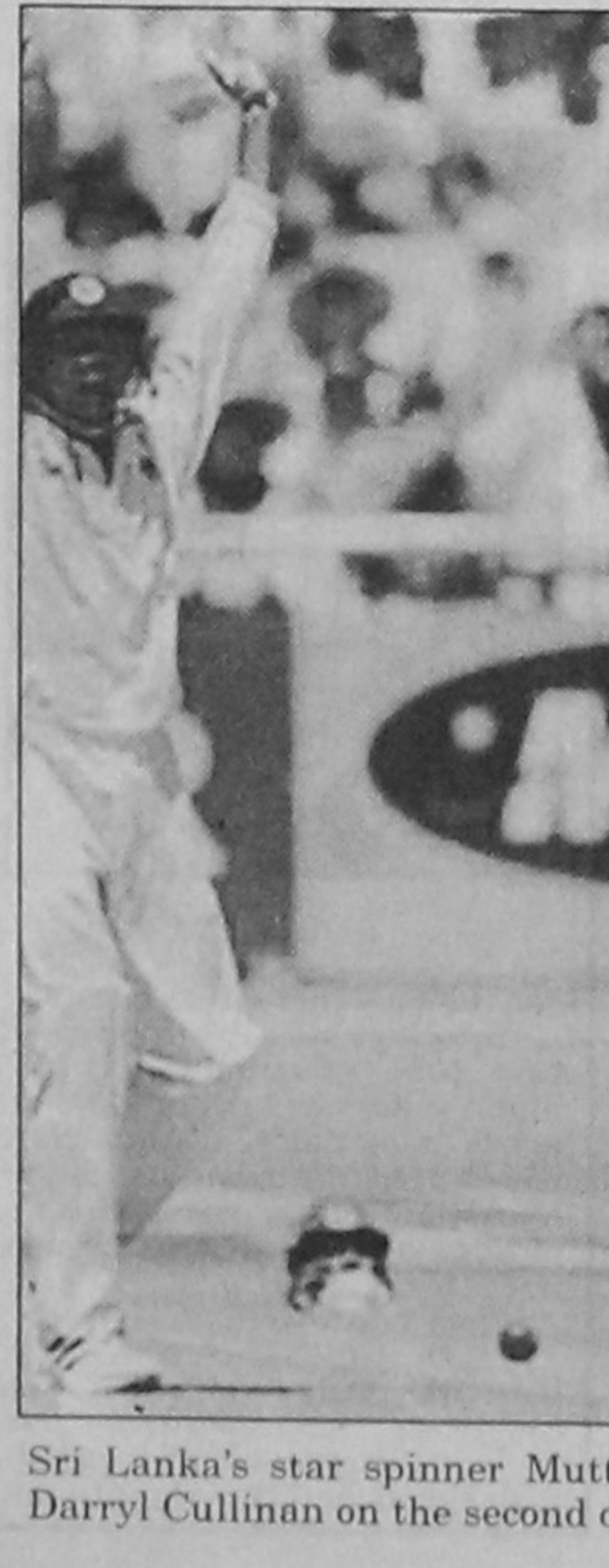
Sri Lanka's star spinner Muttiah Muralitharan appeals for a LBW against South Africa's Darryl Cullinan on the second day of the second Test yesterday.

WEST INDIES: First innings (256/9 overnight) Campbell c and b MacGill 79 Hinds b MacGill 70 Adams lbw b McGrath 10 Lara c M Waugh b MacGill 35 Samuels c Langer b MacGill 28 Sarvan lbw b MacGill 0 Jacobs st Gilchrist b MacGill 12 Nagamootoo c Slater b Miller 12 McLean lbw b MacGill 0 Stuart not out 12 Walsh c Hayden b Miller 4 Extras: (lb-1, lb-1, nb-2) 10 Total: (All out in 102 1/2 overs) 272 Fall of wickets: 1-147, 2-152, 3-174, 4-210, 5-210, 6-272