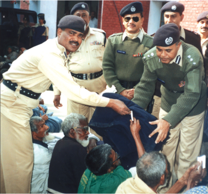
All the members of Sirajganj Police recently donated their one day's salary for the cold-hit poor people of the district. They procured warm clothes and blankets for the distressed people after collecting a total of Taka 50,000. Photo shows Sirajganj SP distributing those among the needy.

SHARIATPUR, Jan 3: More than one lakh fish fries have been produced in the paddy fields of the district in the current season, reports BSS. These fries were produced under a programme chalked out by the Agriculture Extension Directorate (AED) to produce fish fry in aman and boro fields. These fish fries were produced in 100 acres of land in different parts of the district. The production of fish fry in paddy fields has gaining popularity in the district. Now many farmers are engaged in producing fry in their land.