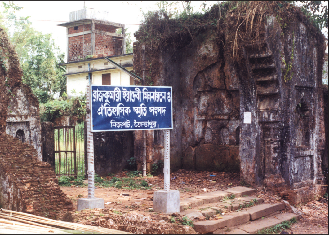
The historic court of King Rajendra which was built in 1706 at Joyantapur in Sylhet district is being destroyed due to sheer neglect of the Archaeology Department.