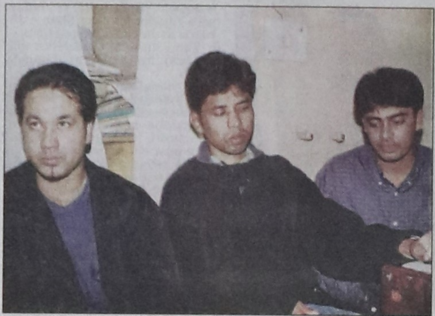
Three young men were arrested from Sonargaon Hotel in the city yesterday with forged credit cards.