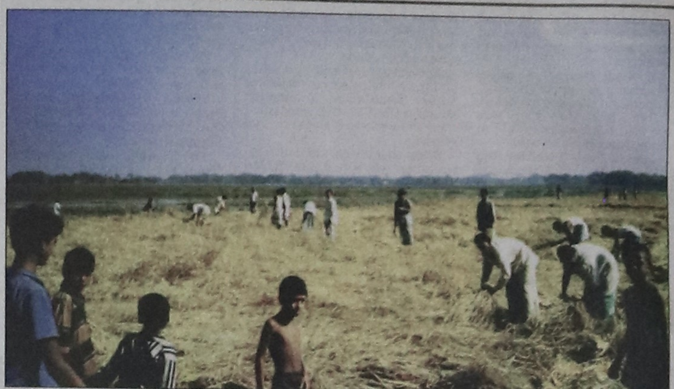
Members of some 400 landless families at work on the paddy field reclaimed from the Bramnir Beel in Pachgachi Union under Pirganj Thana.

The government has again sought the full text of the judicial probe report given by the Justice Hamoodur Rahman commission about Pakistan's defeat in the 1971 Bangladesh liberation war, reports UNB. "We may give our reaction after receiving the full report," Foreign Minister Abdus Samad Azad told reporters at a regular press briefing at the Foreign Office yesterday. Part of the Hamoodur Rahman commission report was recently leaked to the press from the wraps of Pakistani administration about three decades after the war. In reply to a question, Azad however said present relationship between Dhaka and Islamabad is there where it should be. "The relation is good, we want to keep it good," he said, adding that Prime Minister Sheikh Hasina's government believes in peace, democracy and development.