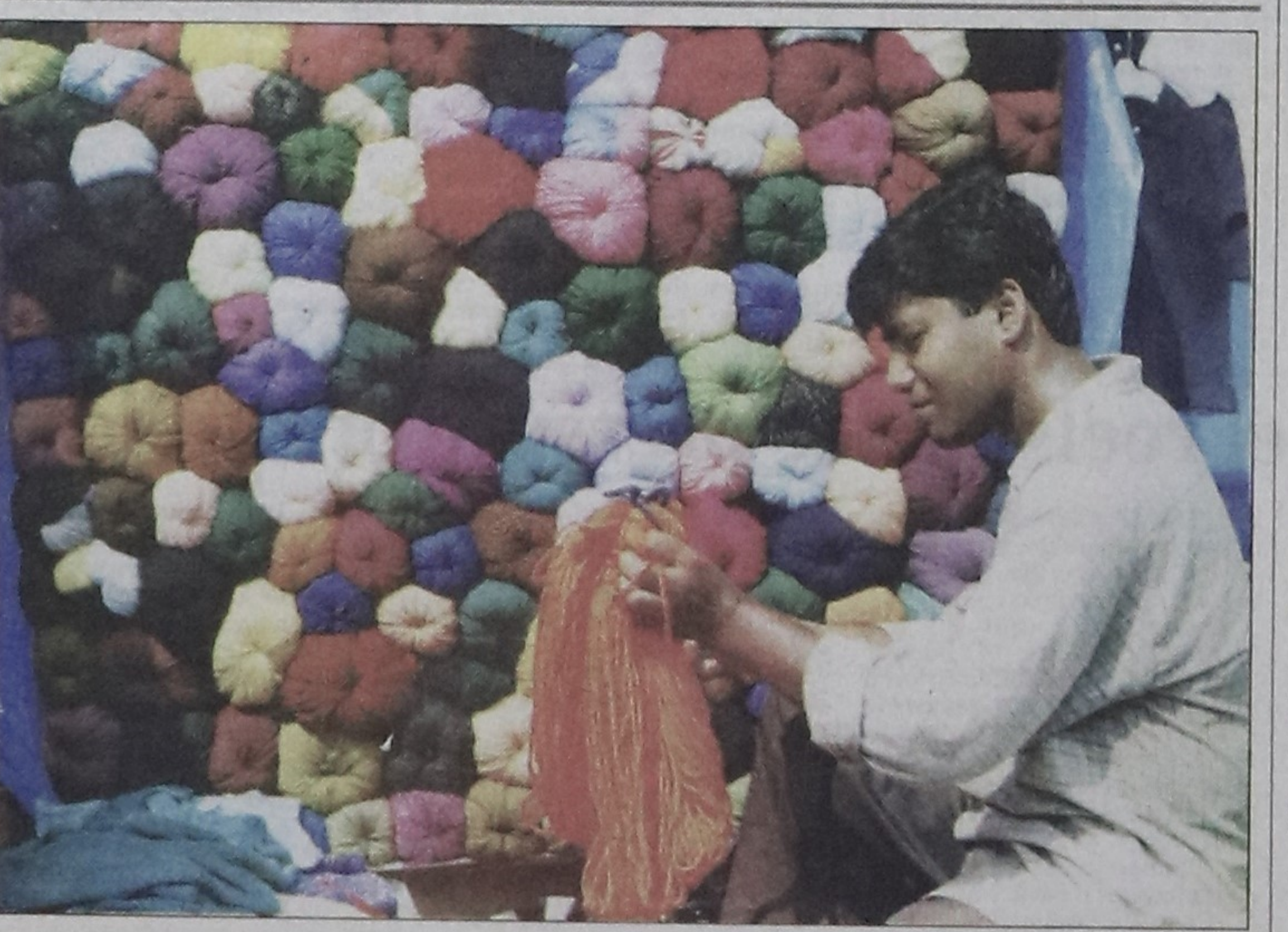
Woolen woes... with bone-chilling winter a distant possibility, this trader must be ruing his decision to cram his shop in the city with wool of different colours and shades.