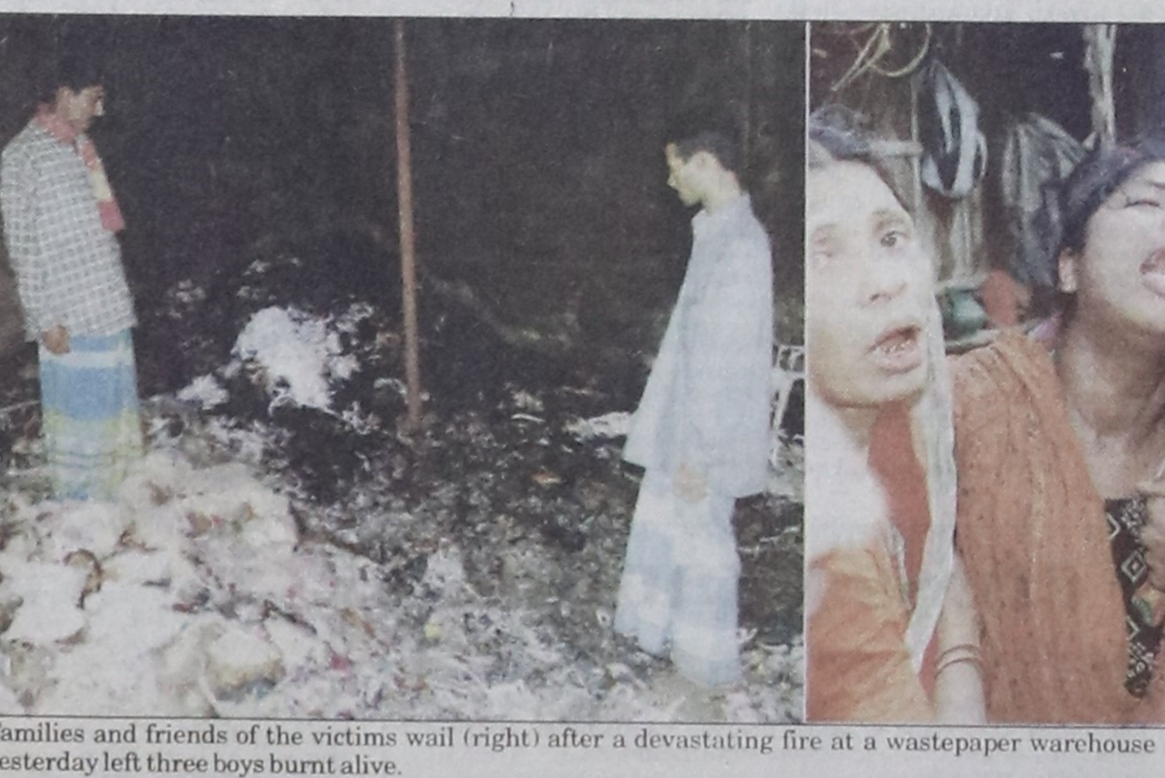
Families and friends of the victims wail (right) after a devastating fire at a wastepaper warehouse in the city's Sutrapur area early yesterday left three boys burnt alive.