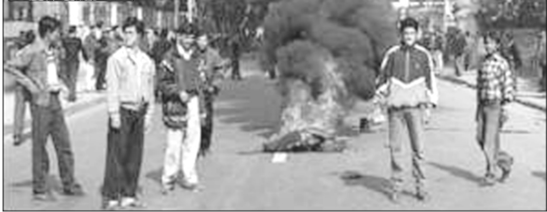
Bollywood star Hrithik Roshan (inset), angry youths burning his effigy in Kathmandu.

Chinese weapons or building of crucial strategic roads by the Chinese are not enough, some Indian politicians of Nepalese origin in the northeastern Indian states once in a while call for Greater Nepal.