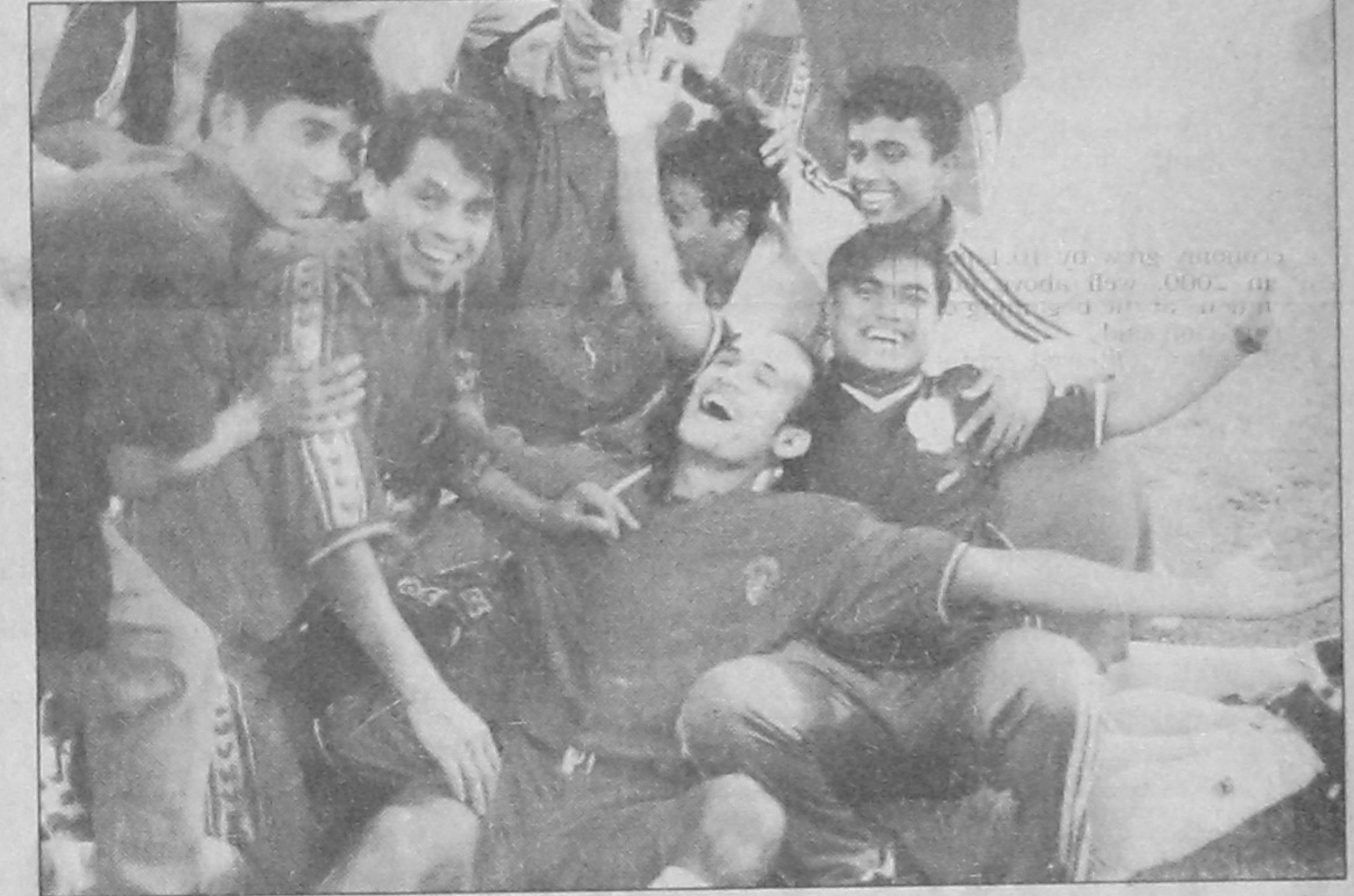
Ecstatic Muktijoddha booters who won the National Bank Premier Division football league title.