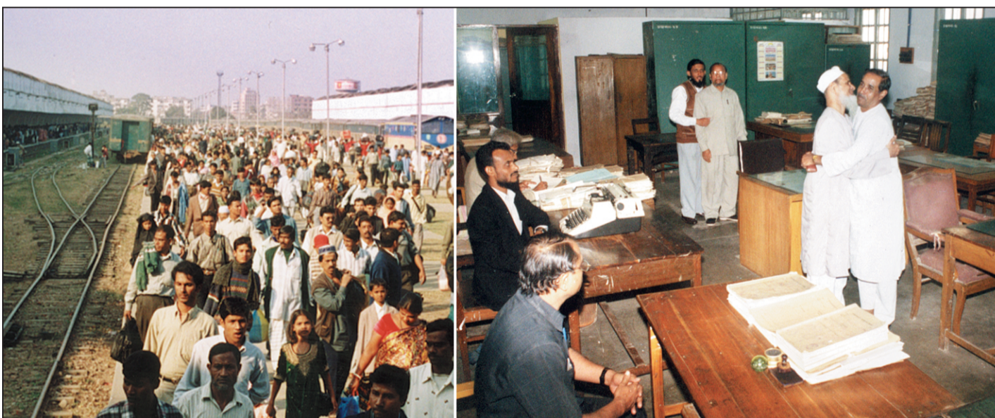
The city has come abuzz with people returning after a nine-day Eid-ul-Fitr vacation (left). Government offices, however, appeared unwilling to come out of the festive mood on the first day of work after the holidays.