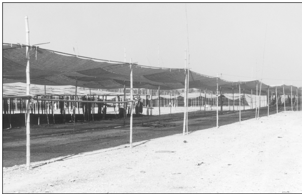
Preparation for Biswa Ijtema is going on. The three-day event will begin at Tangi on January 6.

Muktangan. They have vowed to maintain siege to the central office at any cost and hoist the national and the party flags in the early morning. Besides they have plans to bring out processions on the campuses of Dhaka University and other educational institutions to mark the day. Sources said that leaders opposed to the new committee had decided to deploy activists at different strategic points of the city to stop supporters of Pintu and Laltu from attending the Muktangan rally. Intra-party bickering within the BNP over formation of the controversial JCD central committee has intensified with both the hardliners and moderate factions resorting to mudslinging. The hardliners blame the moderates for instigating wild demonstrations in the capital and elsewhere in the country against the Pintu-Laltu Committee, although, according to sources, those were spontaneous. The agitation may further intensify if the new committee is not immediately cancelled, observed one source.