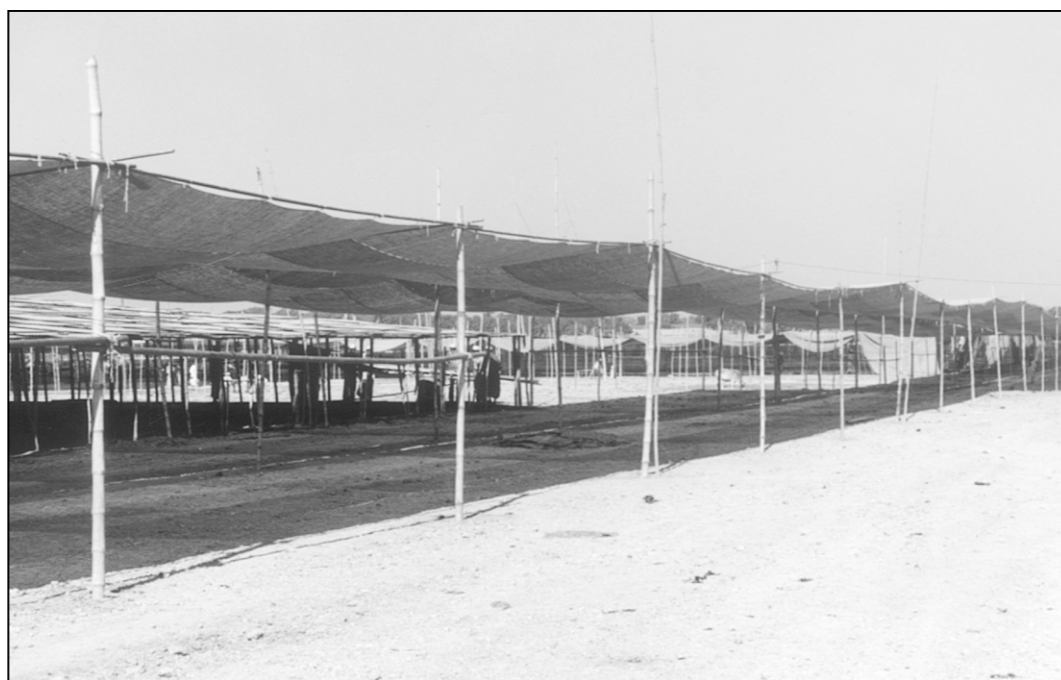
Preparation for Biswa Ijtema is going on. The three-day event will begin at Tangi on January 6.

The agitation may further intensify if the new committee is not immediately cancelled, observed one source.